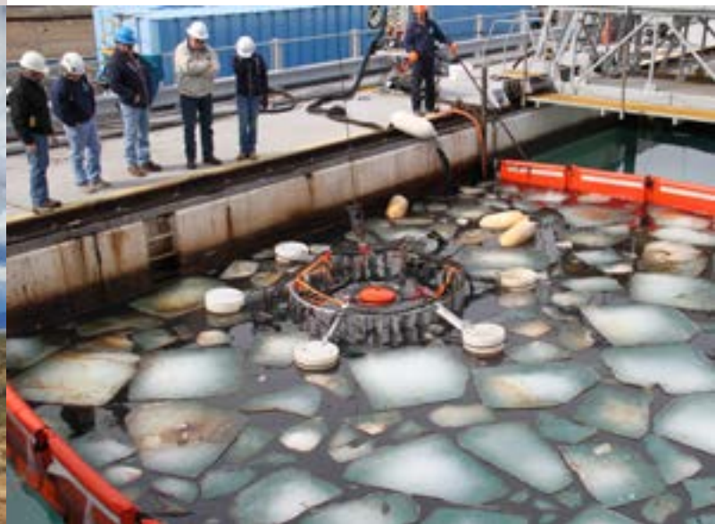
ACTIVE ICE MANAGEMENT (AIM) SYSTEM TESTING OHMSETT FACILITY, NAVAL WEAPONS STATION EARLE WATERFRONT, LEONARDO, NEW JERSEY