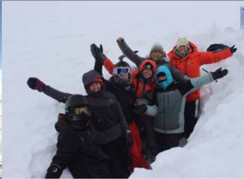
SNOWEX PIT TEAM GRAND MESA, COLORADO PHOTO BY LAUREN FARNSWORTH TERRESTRIAL AND CRYOSPHERIC SCIENCE BRANCH