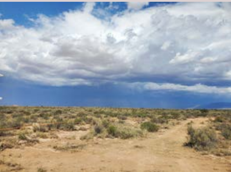
LATE AFTERNOON DESERT STORM WHITE SANDS, NEW MEXICO