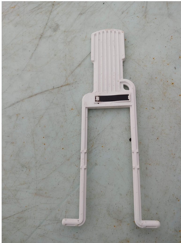
Photos of Scandies Rose Emergency Position Indicating Radio Beacon Housing