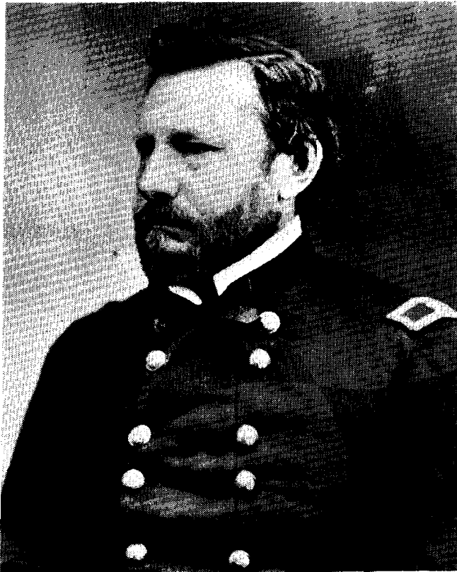
Col. Albert J. Myer