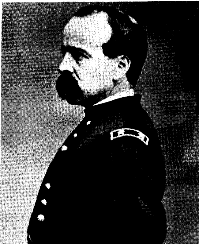
Maj. Gen. Daniel Butterfield

Against staff advice favoring an attack downriver, below the point of Burnside's main thrust, Hooker decided to move against Lee's left (upriver) wing. He would send his cavalry far around the Confederate left to break the Richmond-Fredericksburg railroad. If both halves of the scheme worked, or even if only the first half worked, he might, by getting in Lee's rear, bag virtually the whole Army of Northern Virginia.