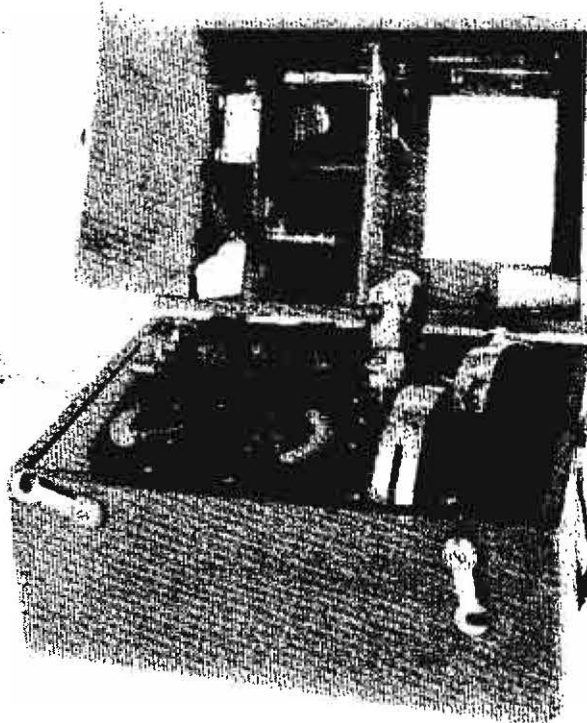
A. U.S. Army Signal Corps receiver typical of those used during World War I. This is the AR-4 (SCR-54), a crystal detector set used for receiving fire control instructions from airplanes. Its frequency range was 545 to 1200 kHz.

Hiding an intercept antenna was also a problem. But when it could be done (in woods, for example), and when armies were on the move, the intercept stations heard signals in such confused abundance as to make today's intercept operator want to hang up his earphones. The