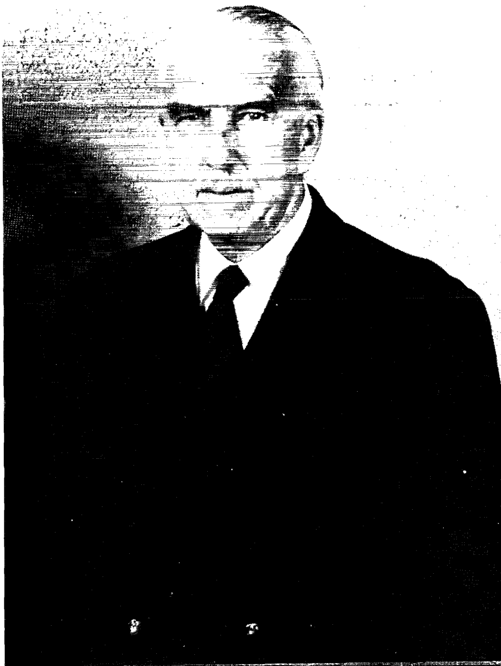
John H. Tiltman