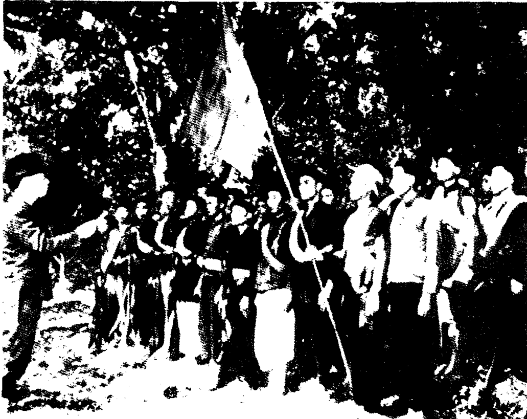
(U) Vo Nguyen Giap addressing Armed Propaganda Unit, 1945