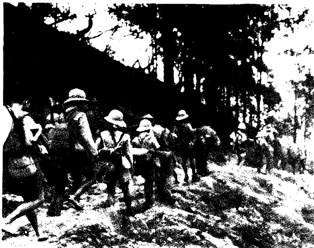
(U) French colonial troops retreating into southern China, March 1945