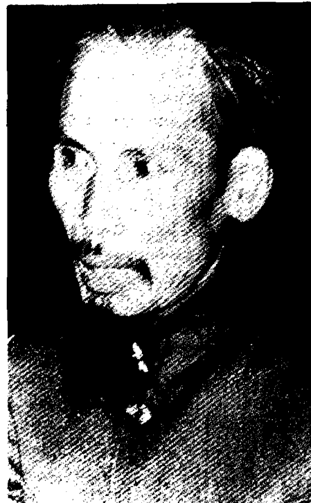
Ho Chi Minh

(U) In April 1944, Hanoi reported the existence of two groups: the Viet Minh and the Dong Minh Hoi. The Japanese Army also had information about a communist group that had an office on Tientsin Road in Hanoi. This may have been the Indochinese Communist Party which was the core of the Viet Minh political arm. The report goes on to describe how these communists used employees of the French Post and Telegraph Department in an unknown capacity. 21 They issued a regular periodical (possibly the Viet Lap or Independent Viet Nam ) and held regular lectures. The report went on to describe several instances of propaganda leaflets being distributed in rural areas. The Japanese were not certain of the names of the leaders of the communist activity, except for Nguyen Ai Quoc (Ho Chi Minh). 22 The Japanese also admitted that the movement had spread (though they didn't say how far) and that it had a definite anti-Japanese flavor to it, as well as the expected anti-French.