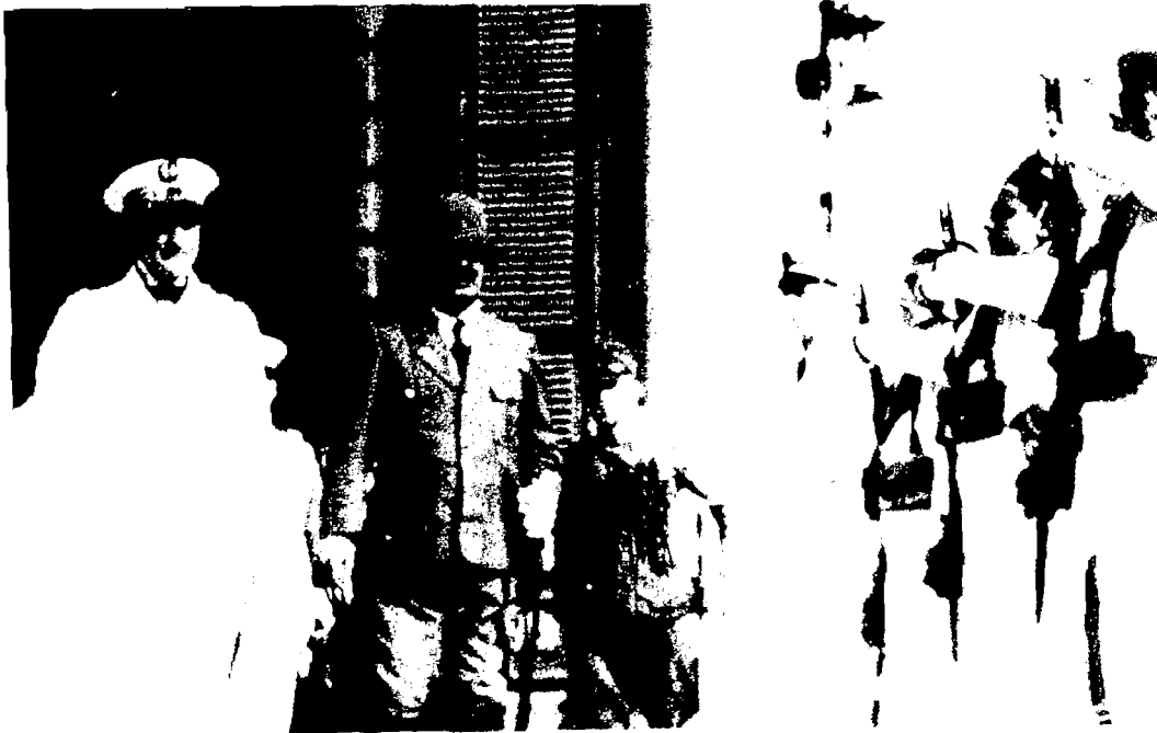
(U) French governor-general Admiral Jean Decoux and unidentified Japanese general officer receive salute from French sailors.

Foreign Legionnaires, backed by artillery and planes, struck back mercilessly. The American consul in Saigon reported that the French were "promiscuously machine-gunning" towns and burning entire villages. 2 Thousands of Vietnamese were imprisoned or executed. The Japanese, reporting from Saigon to Tokyo on the state of affairs in Indochina at the end of November, referred to this as "a little unrest" caused by sweeps against the communists in Cochin China and blamed it on Vietnamese who were "puppets" of either the Chinese or Gaullists. 3