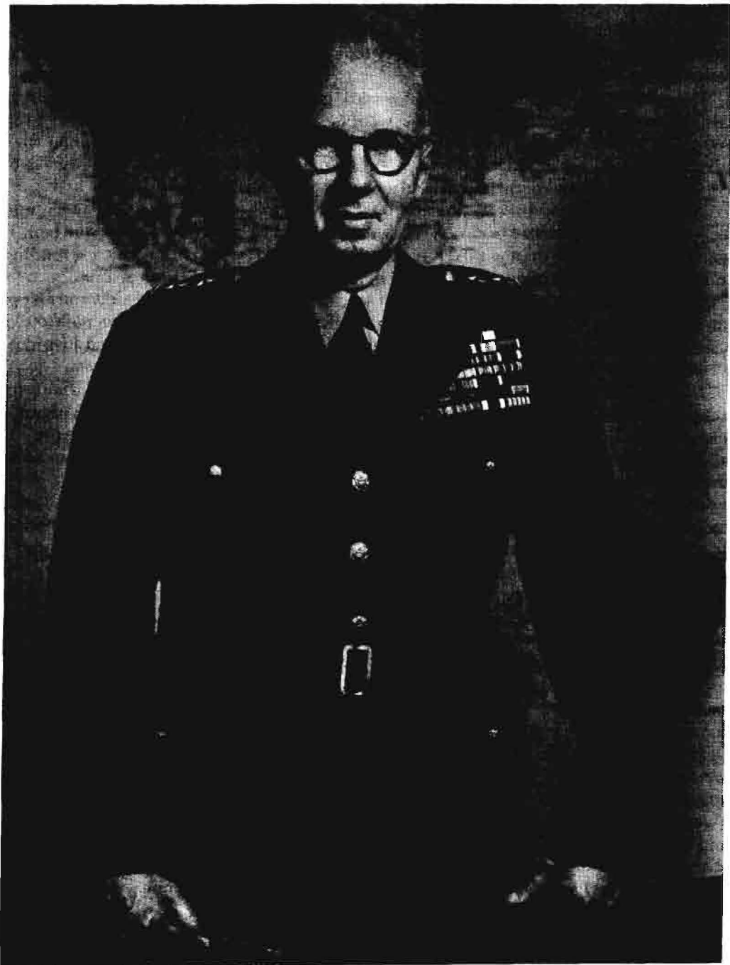
Lieutenant General Ralph J. Canine, USA