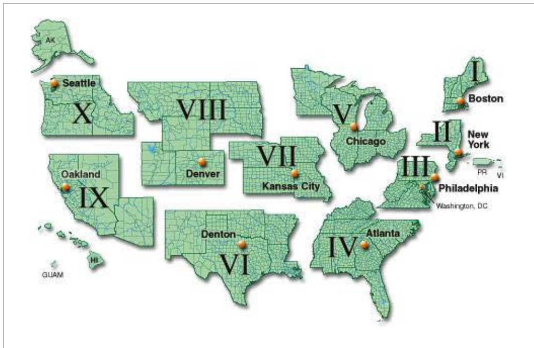
Figure. 10 FEMA Regions

FEMA consists of 10 geographic regions in the continental United States and territories, and the DoD supports each region in providing response and relief efforts. See Figure for a map of the FEMA regions.