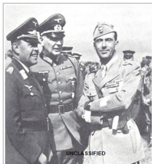
(U) From left, General Albert Kesselring with two of his subordinates in the Italian campaign

(U) In one message to his superiors, Kesselring complained of the demoralizing effect on his men of constant harassment by American war dogs in Italy.