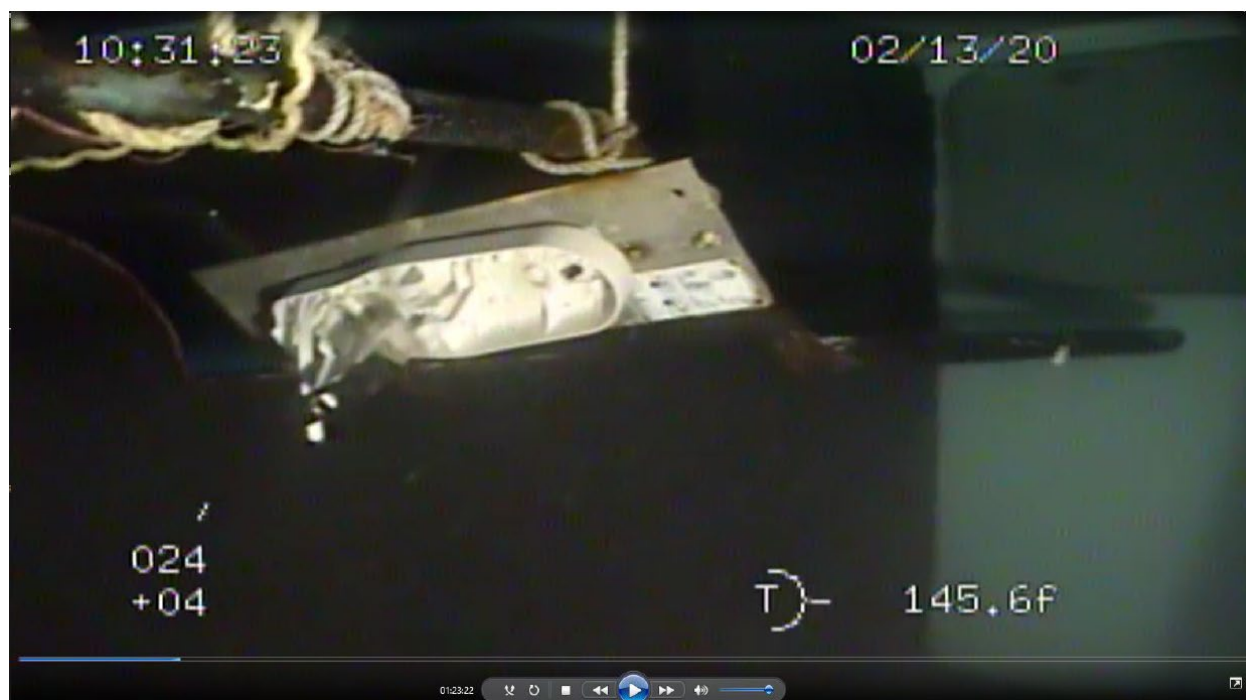
Screencapture of ROV Footage taken by Global Diving & Salvage, Inc., dated February 13, 2020