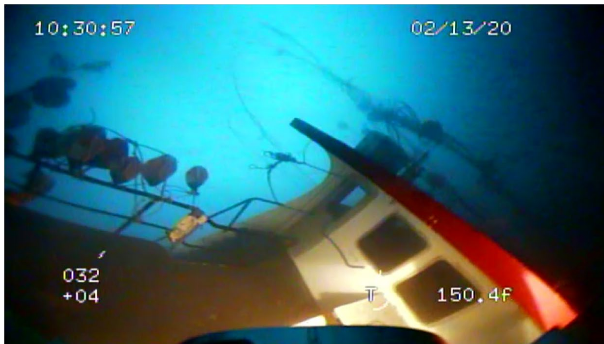
Screencapture of ROV Footage taken by Global Diving & Salvage, Inc., dated February 13, 2020