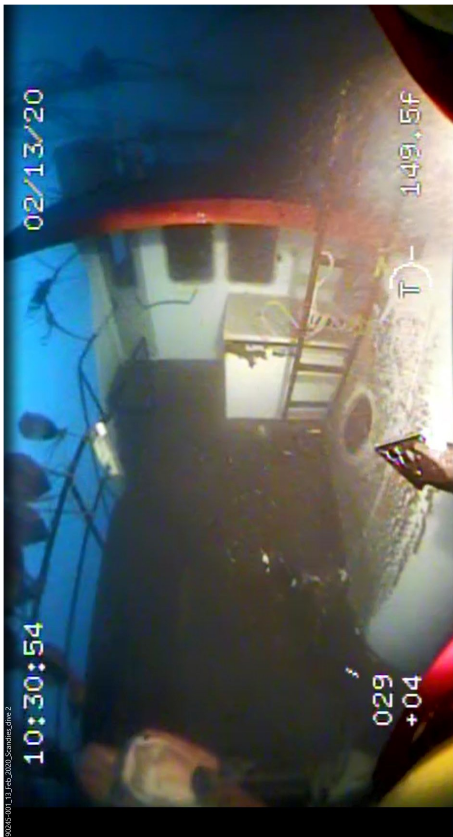
Screencapture of ROV Footage taken by Global Diving & Salvage, Inc., dated February 13, 2020