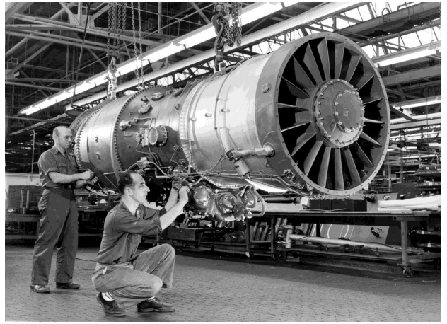
J-75 Engine at Depot

Having the information and making it available are two different conversations. Our office is undertaking a massive digitization and outreach effort that we're calling Historical Intelligence. HISINT represents a combination of 100 TB of digital information paired with machine learning that eliminates the querying of 33 independent finding aids and associated metadata. The process was onerous and required substantial specialization to navigate the archive. This opens the collection accessibility dramatically. The difference is between a modern search engine compared to your childhood library.