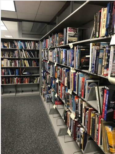
Walter Boyne Library