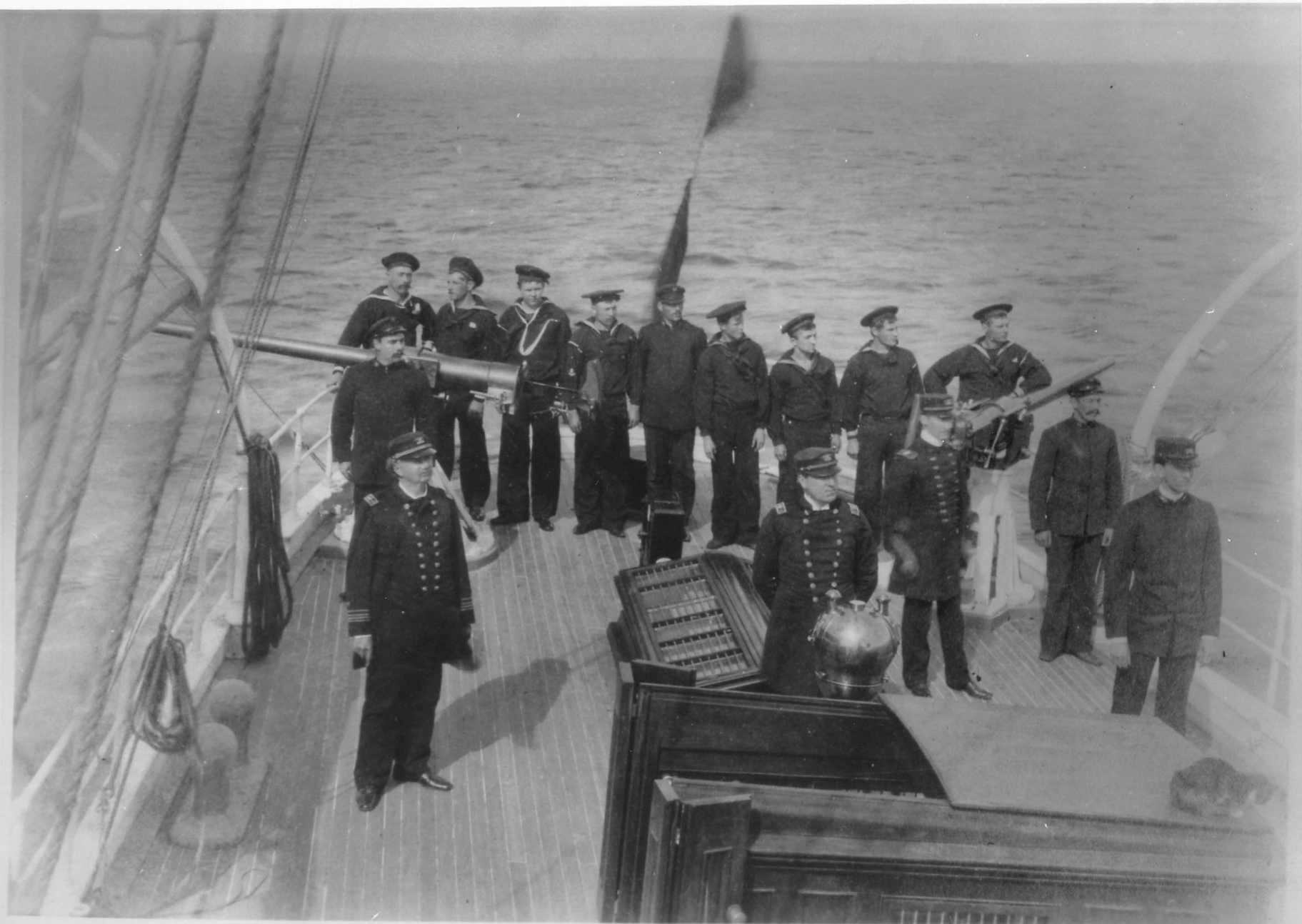
Crew of Seminole at close of World War. J