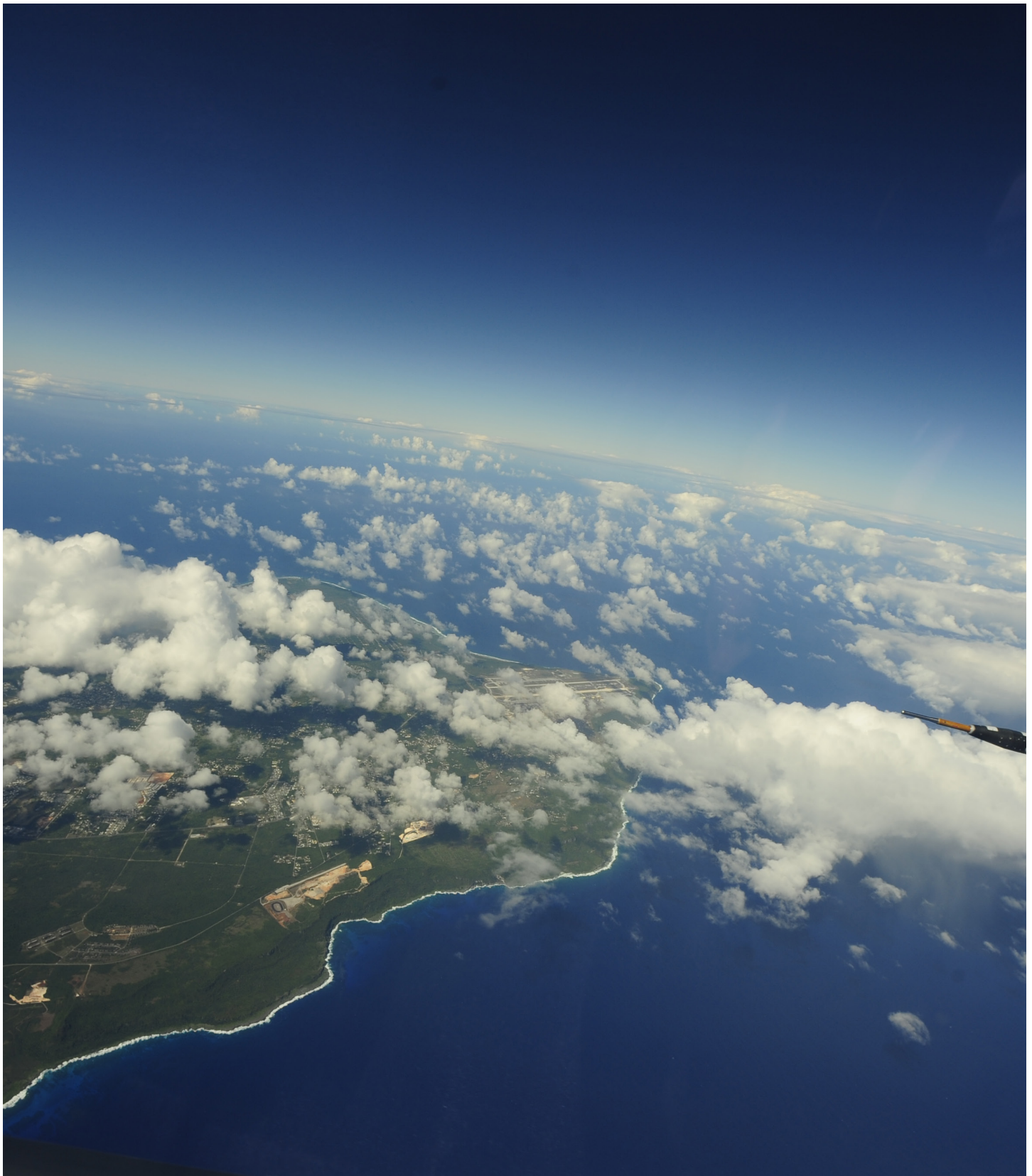
Andersen Air Force Base, Guam, is photographed from an F-16D Fighting Falcon during Exercise Cope North.