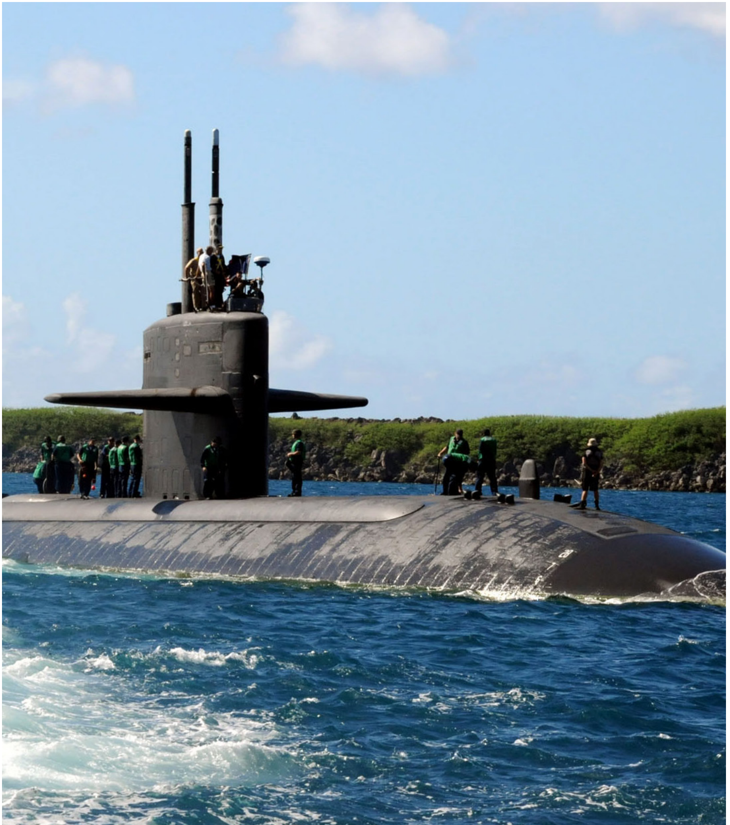
U.S. Navy attack submarine in the Port of Guam.