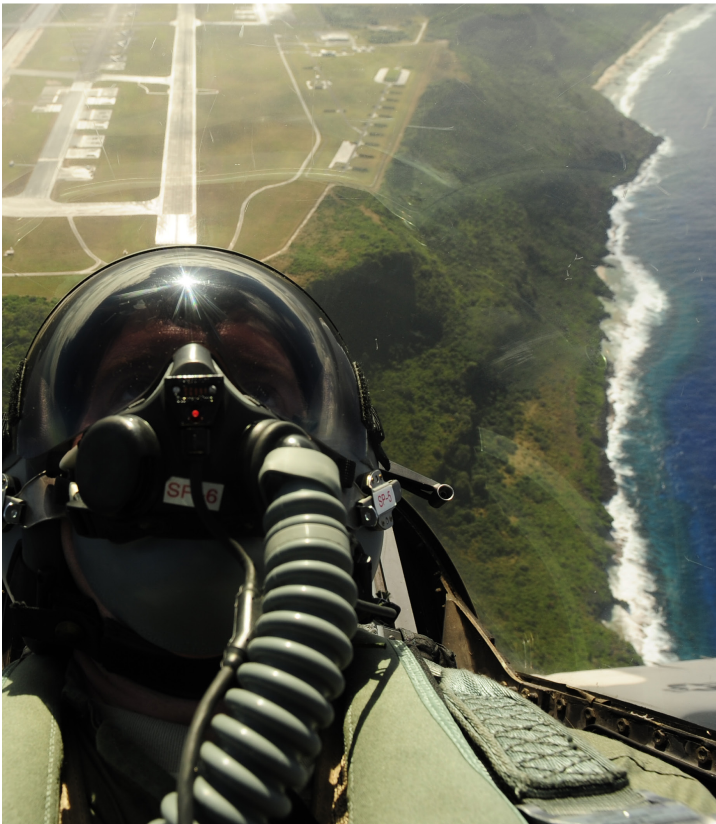
A U.S. Air Force F-16D Fighting Falcon aircraft departs the runway at Andersen AFB, Guam.