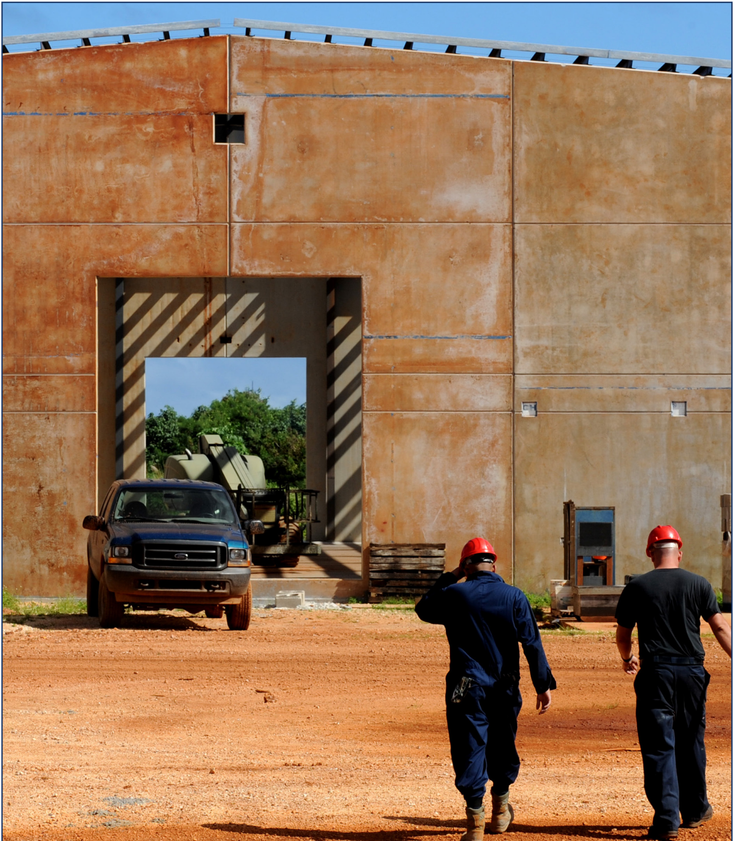
U.S. Air Force personnel perform ongoing construction at Andersen AFB, Guam.