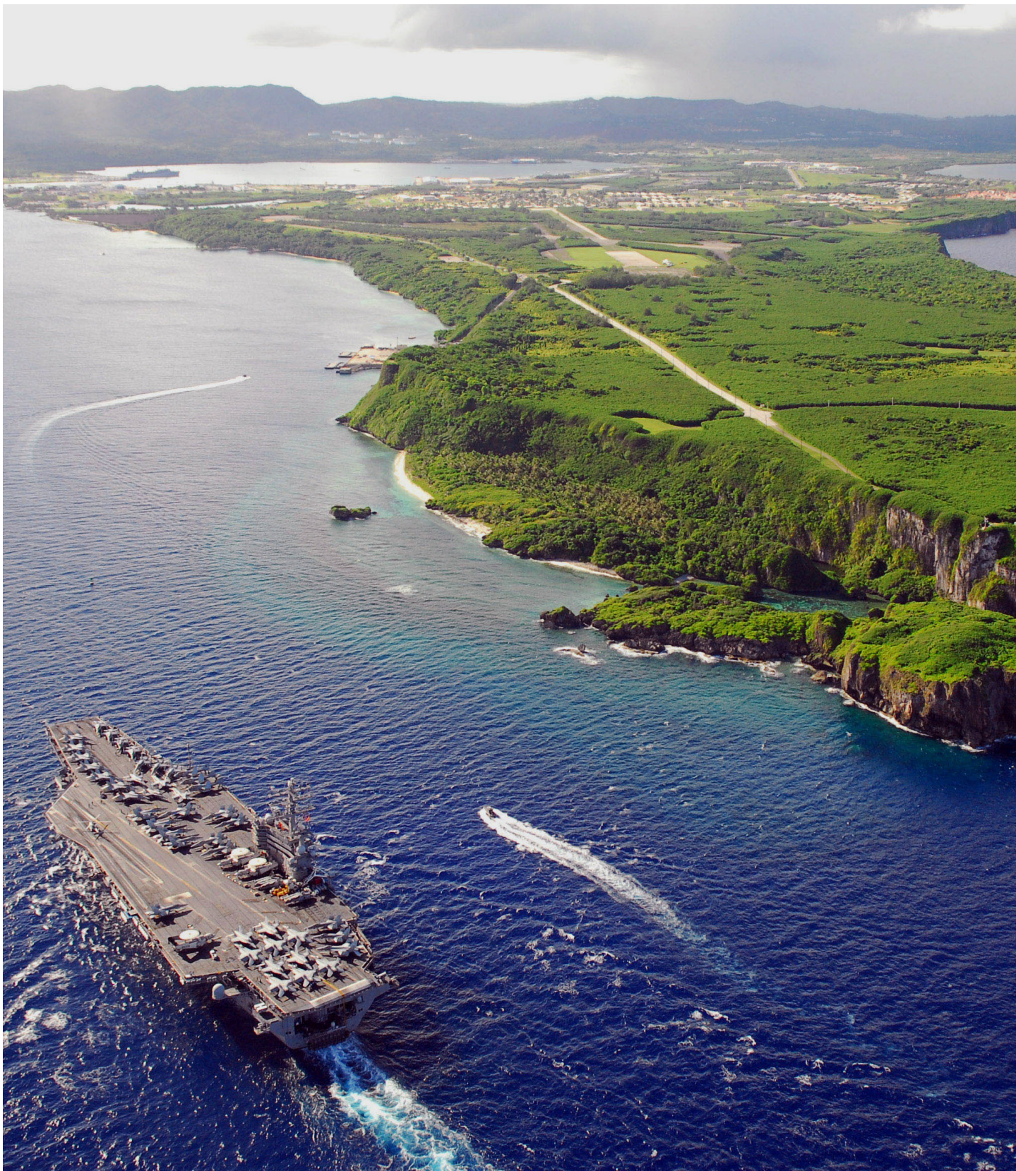
U.S. Navy aircraft carrier navigates to the Port of Guam.