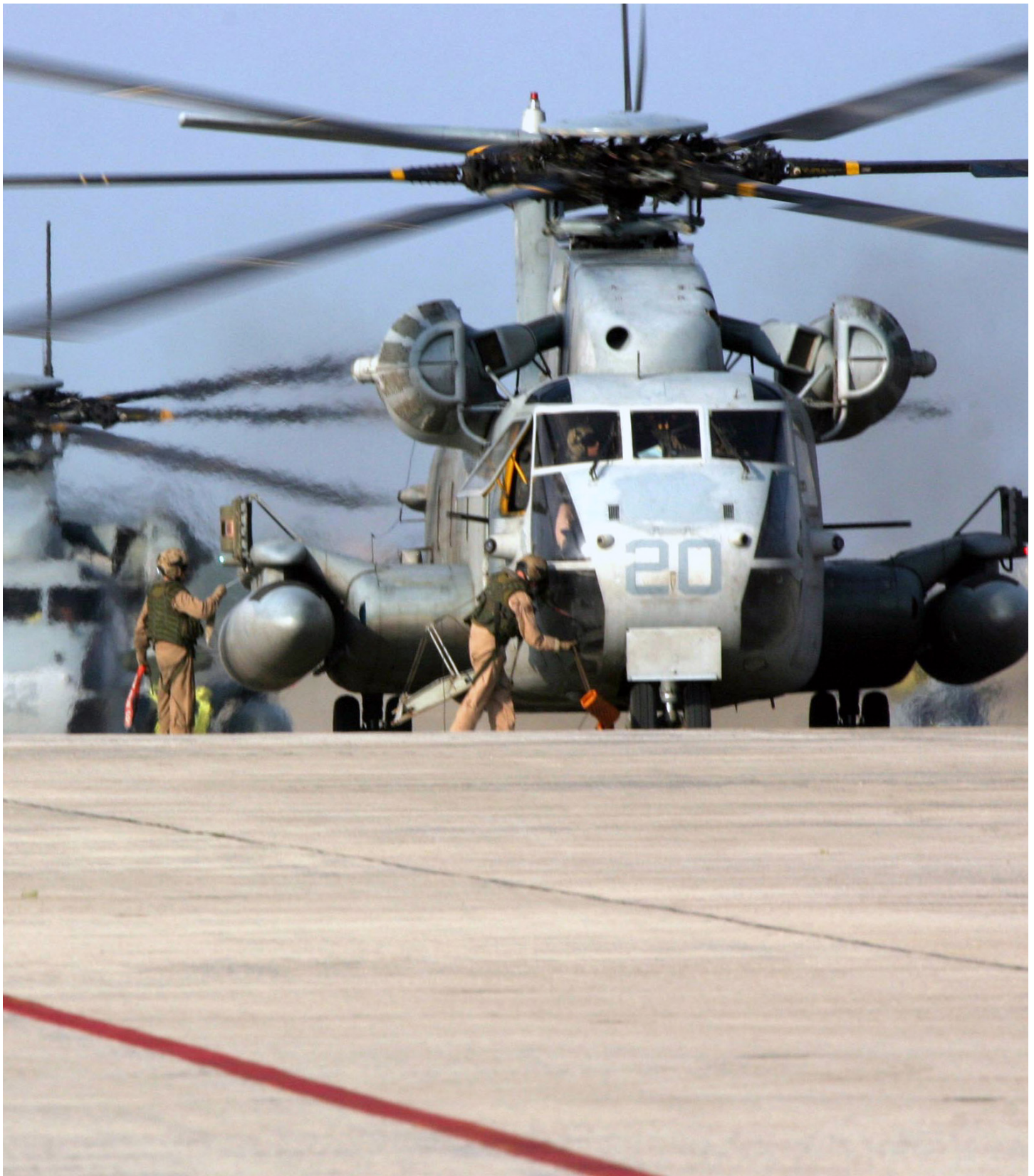
Marine Corps CH-53 helicopters prepare for flight.