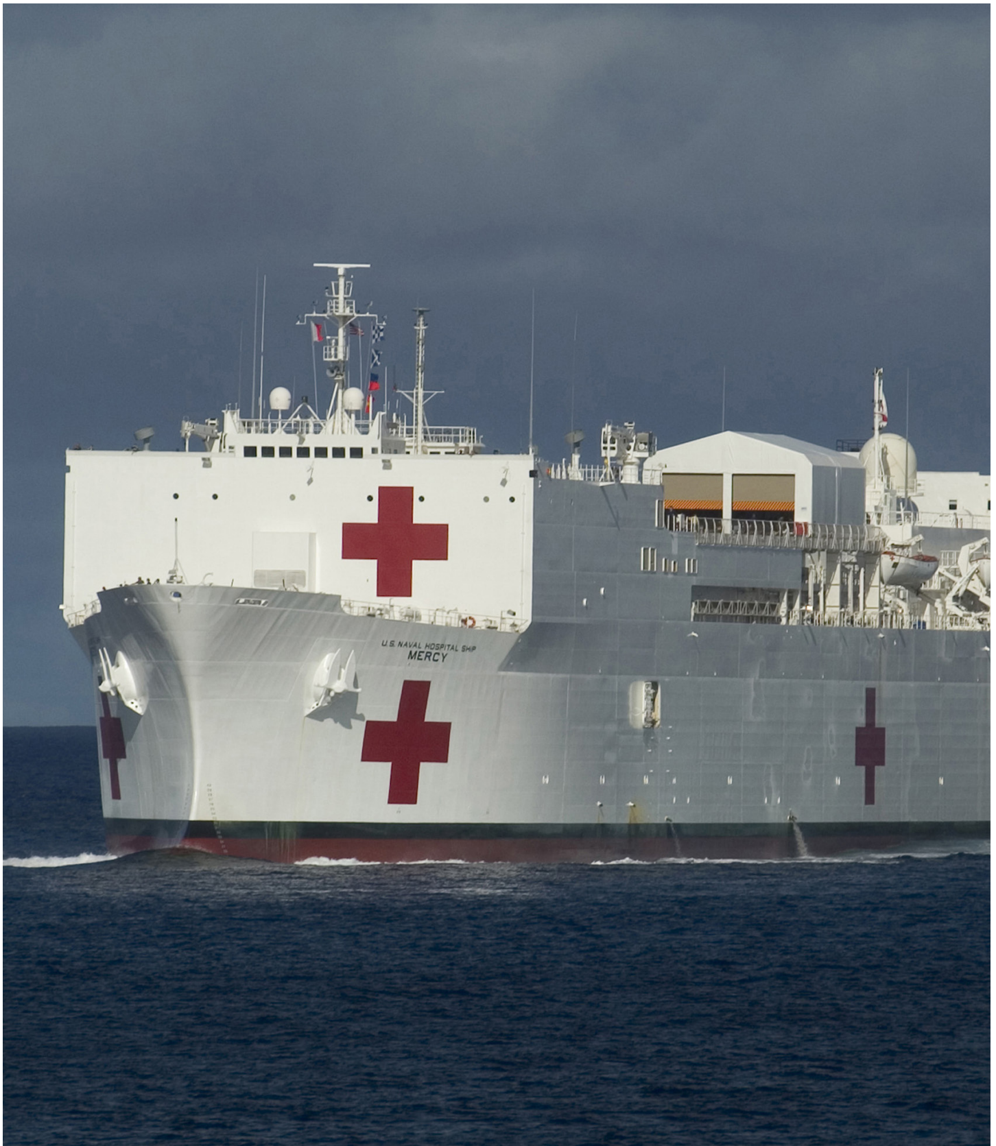
U.S. Naval Hospital Ship Mercy at sea.