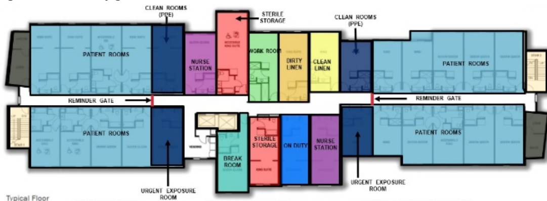
Figure 1. ACS Configuration With Individual Rooms