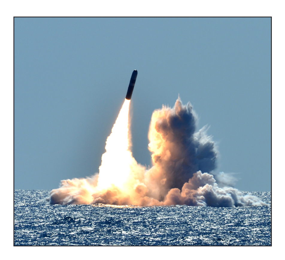
From the Depths, We Strike!

U.S. Submarine Force and Supporting Organizations