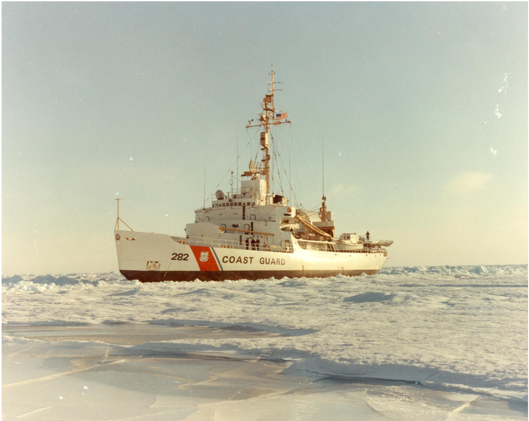
USCGC Northwind in ice, no date.