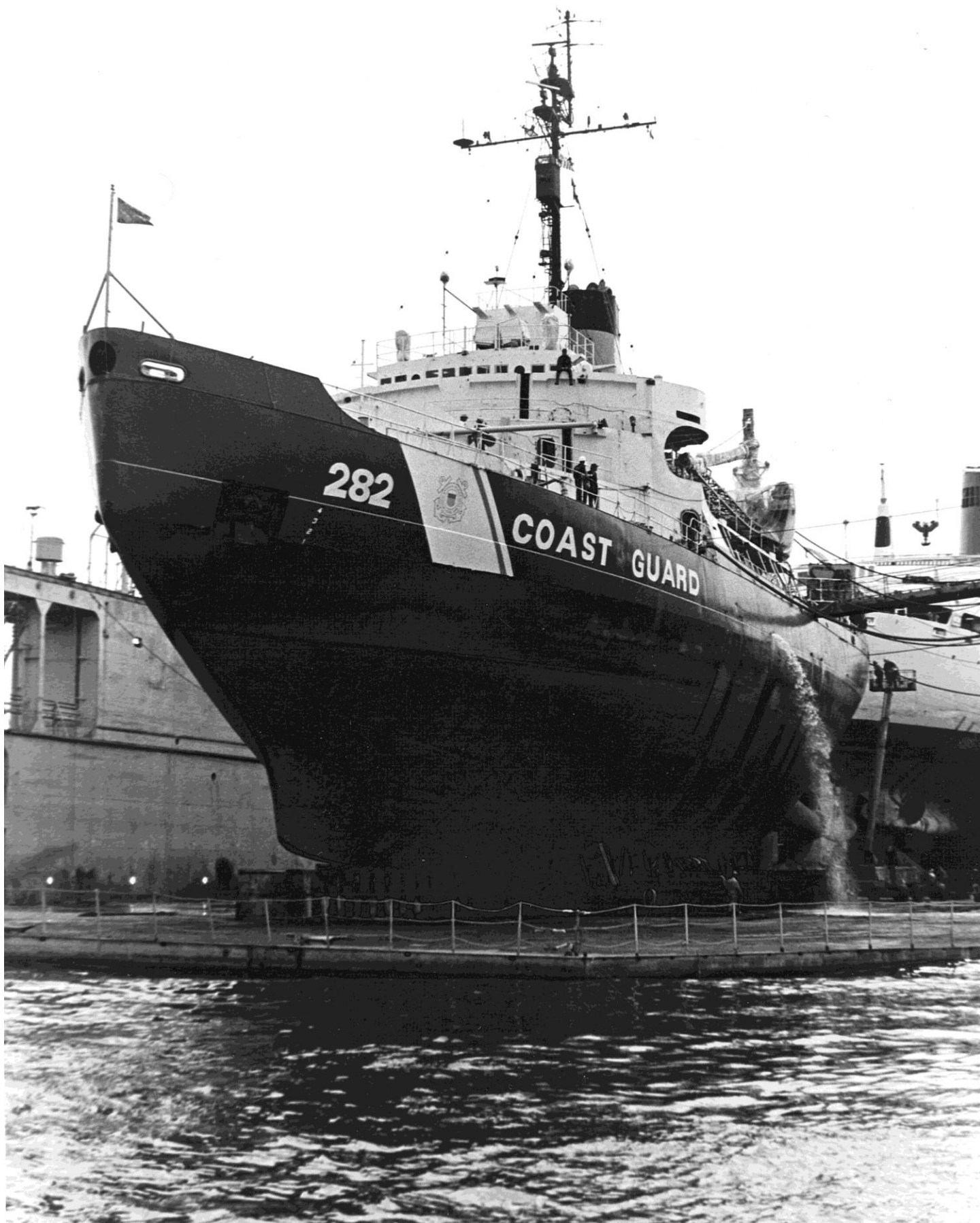
USCGC Northwind in drydock in 1980 (note the distinct shape of the hull and ice-breaking bow)