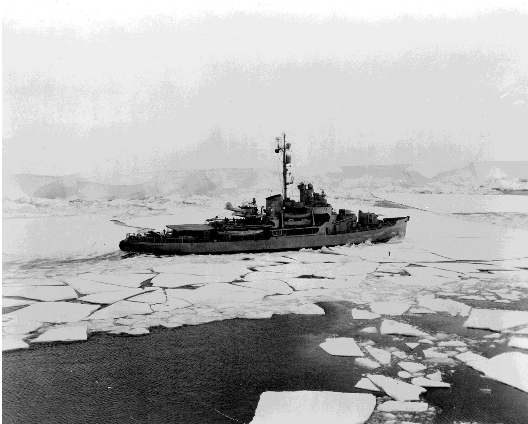
USCGC Northwind in the Bay of Whales, Antarctica, 1947