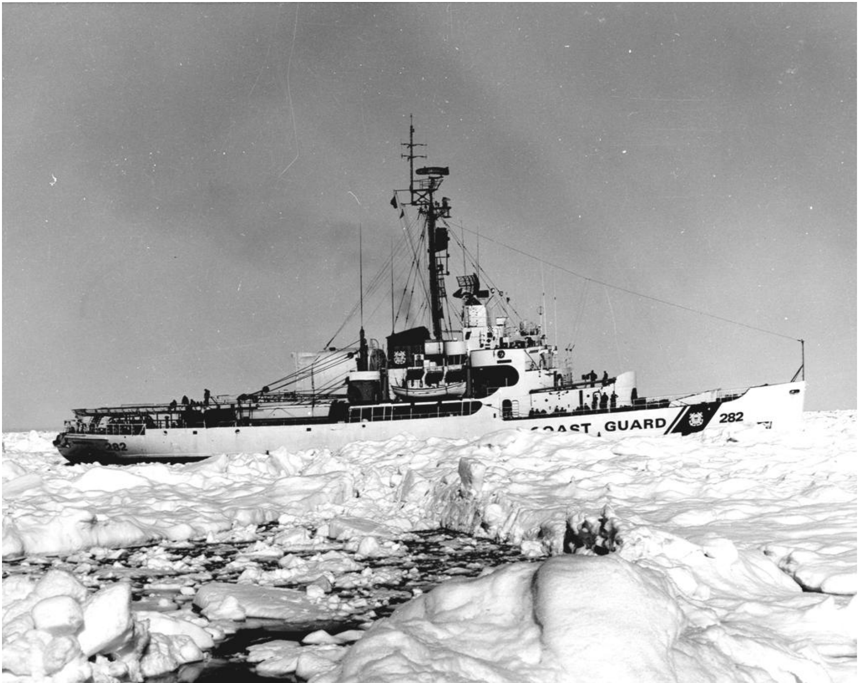
USCGC Northwind in ice- no date