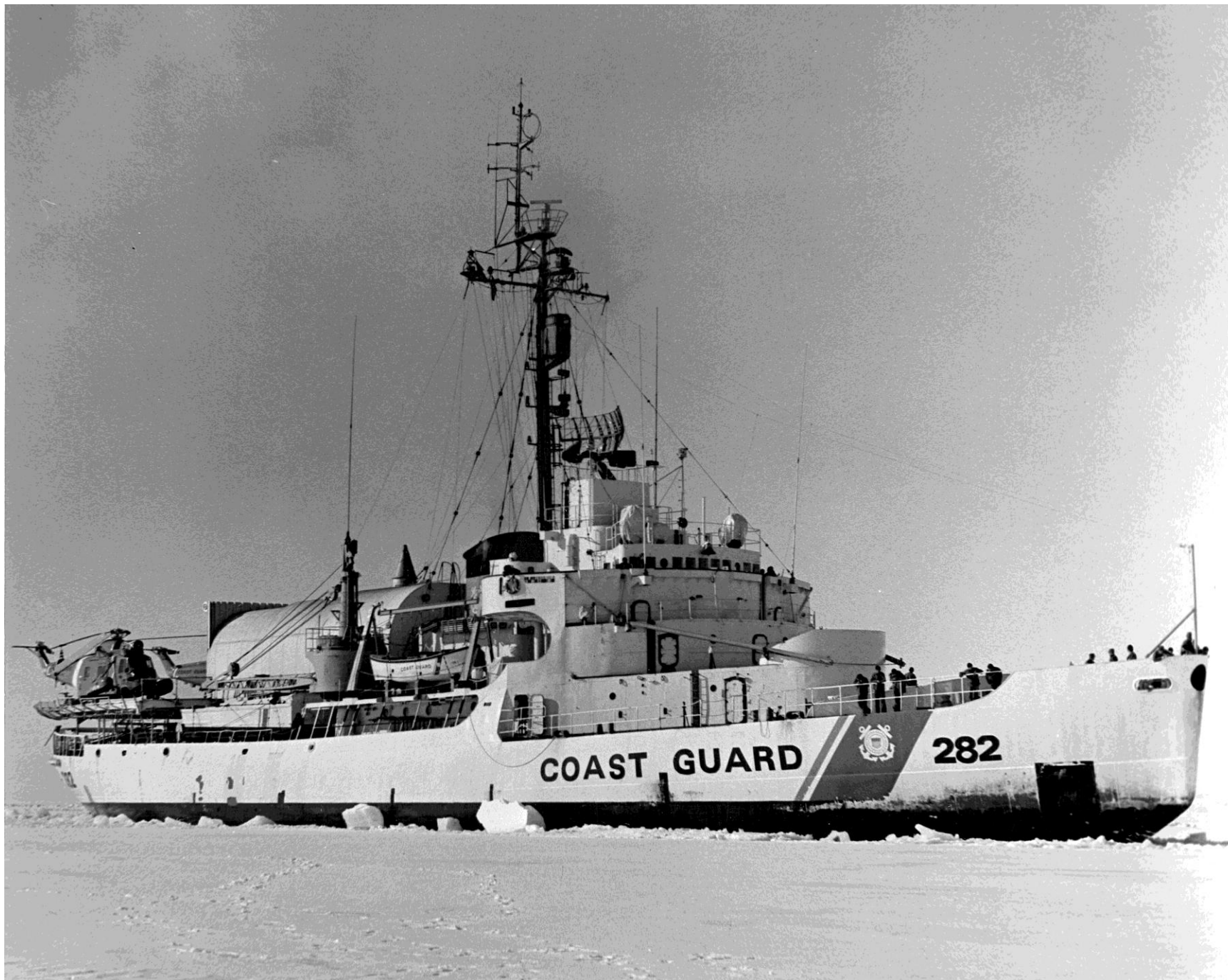
USCGC Northwind in ice- no date