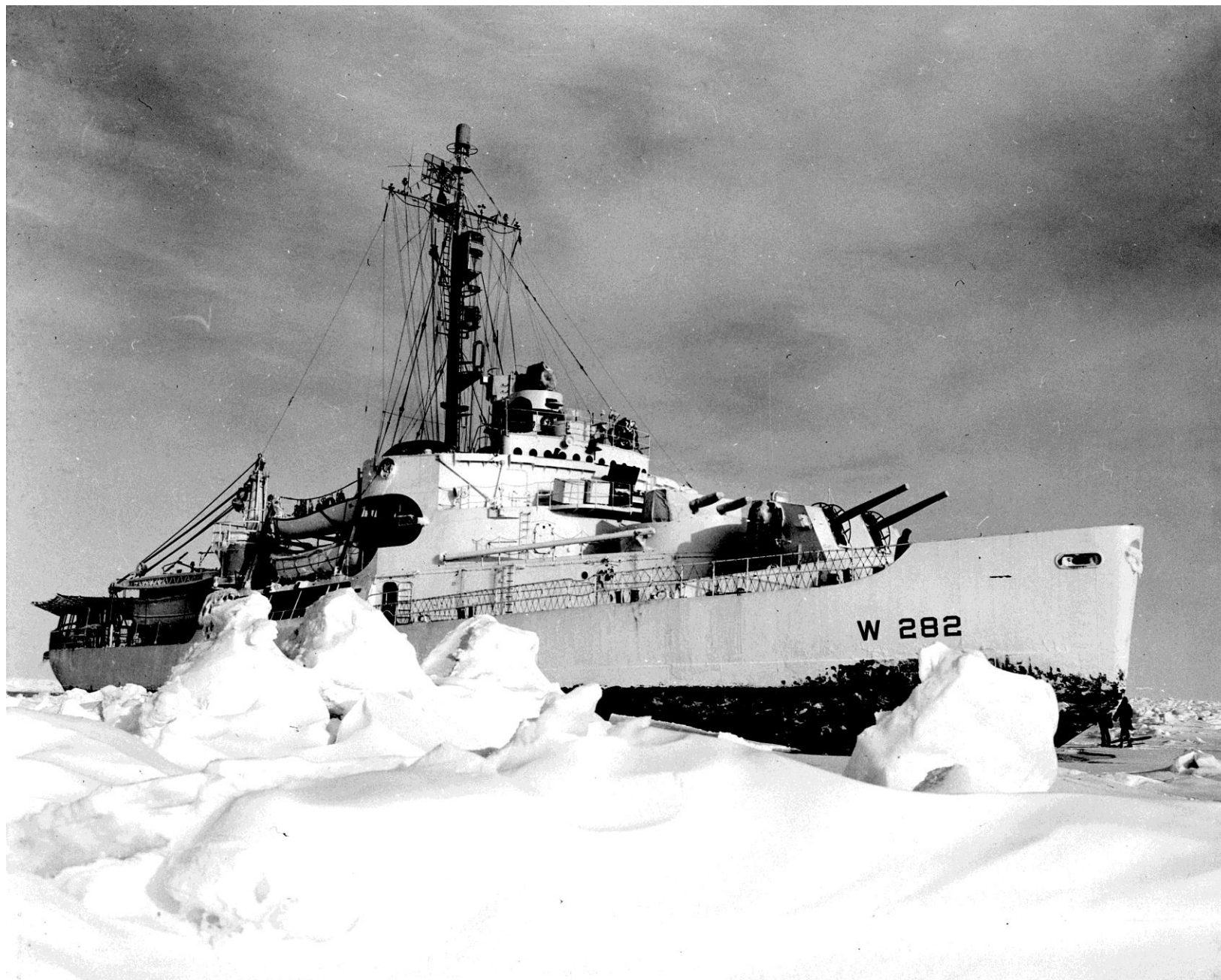
USCGC Northwind in ice- no date