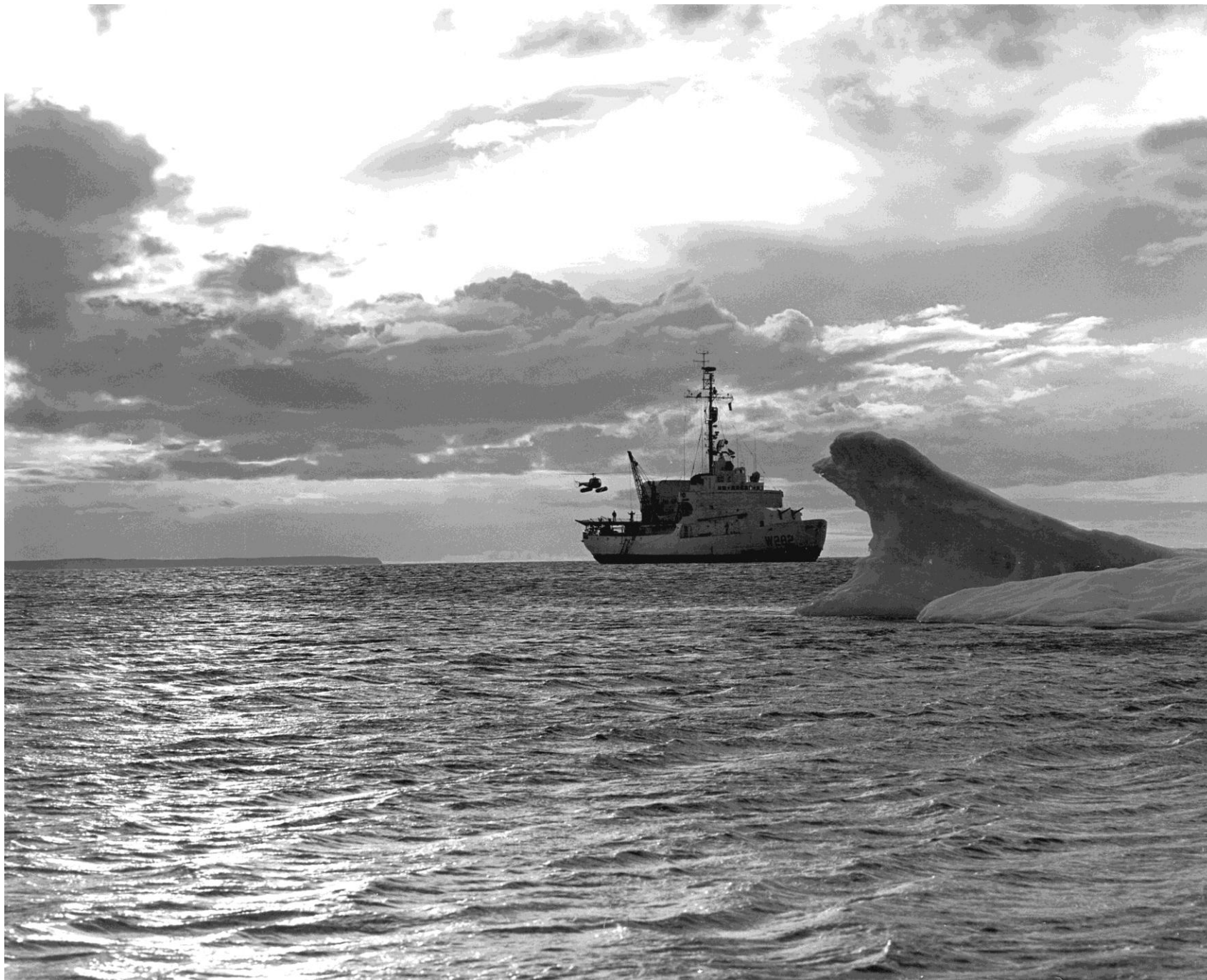
USCGC Northwind off Cape Parry, Northwest Territories, Canada- 1 September 1964