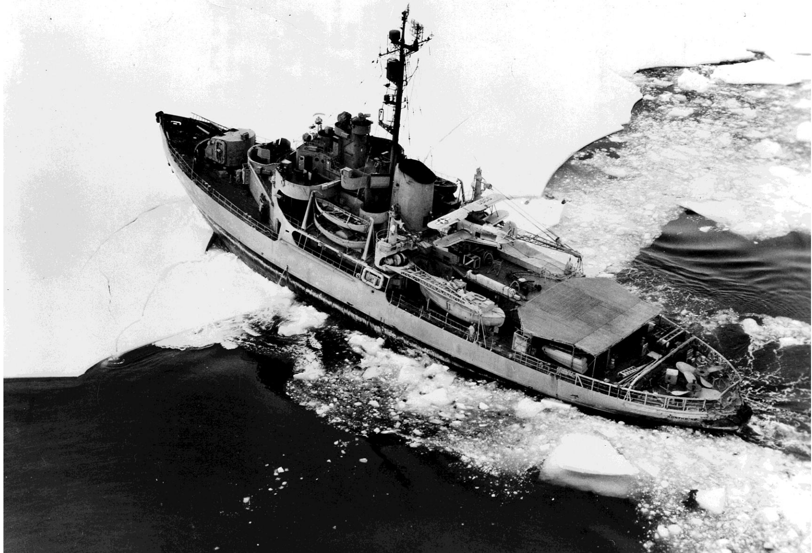
USCGC Northwind breaking ice in Antarctic- 1947