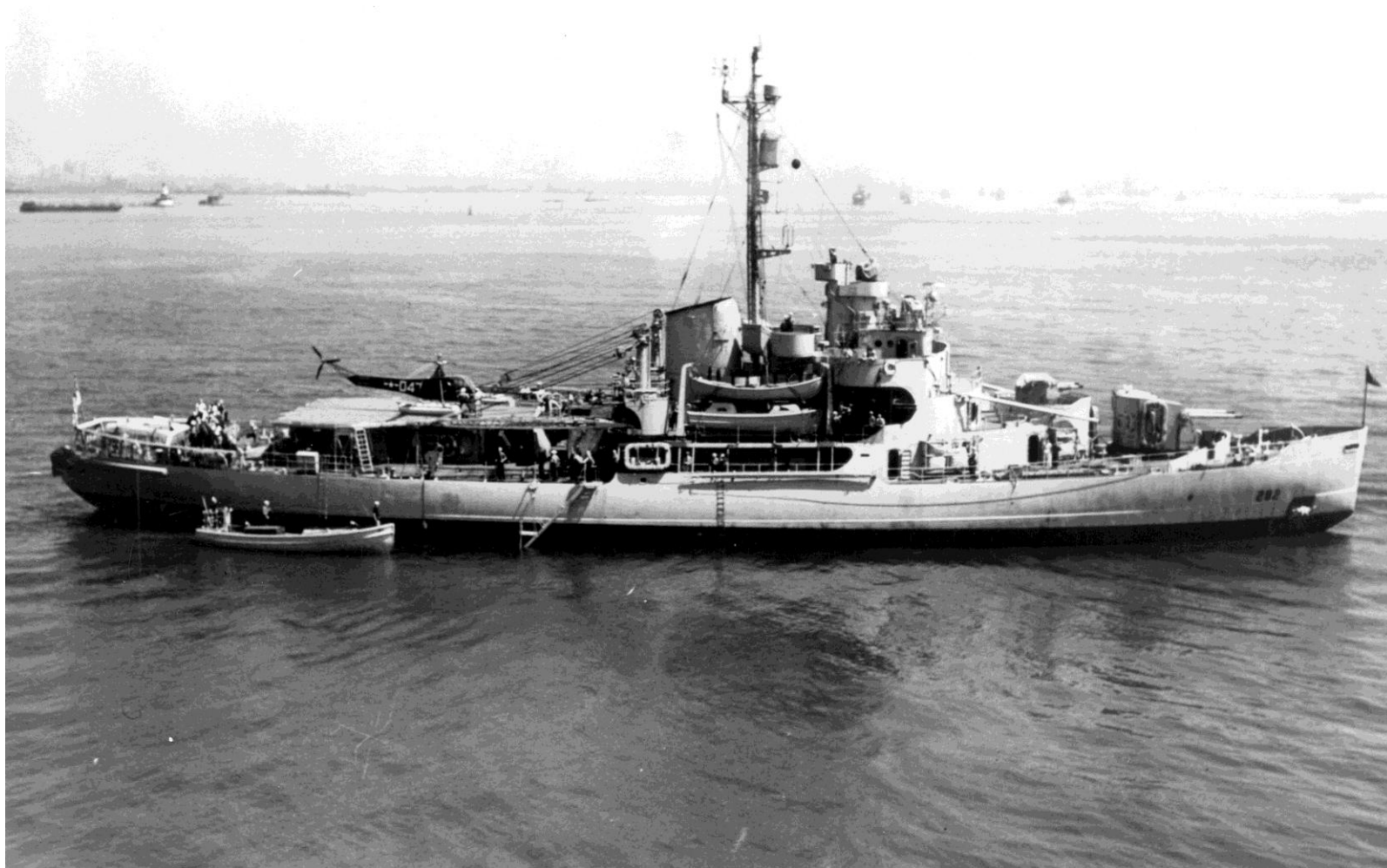
USCGC Northwind in New York Harbor- 26 June 1946. Note the Sikorsky HNS on Northwind 's new helicopter landing pad.