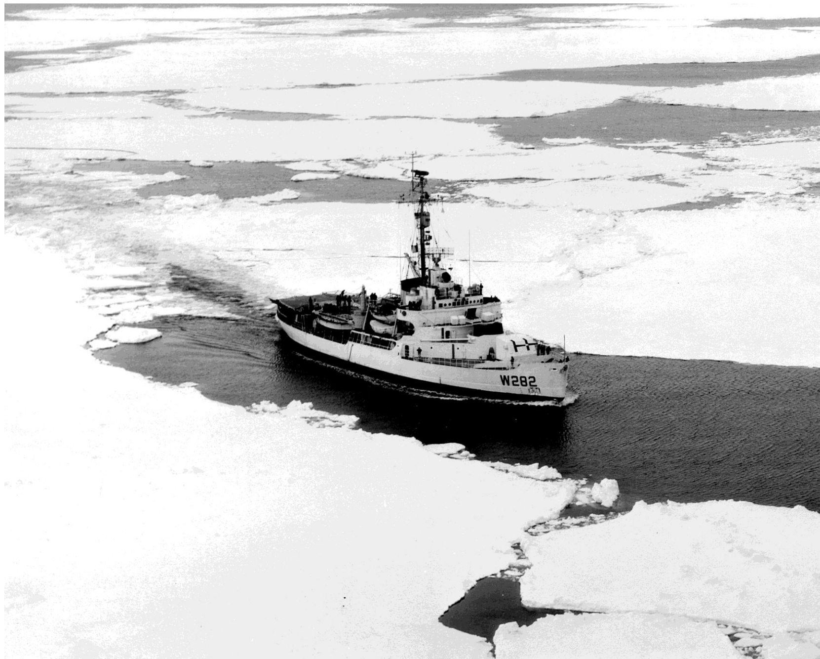
USCGC Northwind during Operation Deep Freeze- 14 December 1956