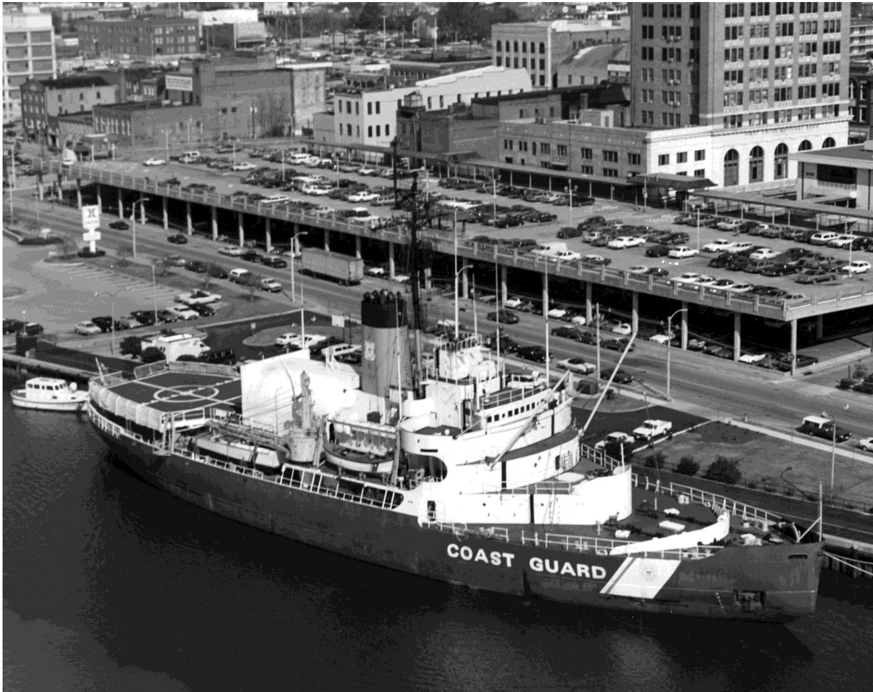
USCGC Northwind tied up at her homeport of Wilmington, NC- 4 February 1985