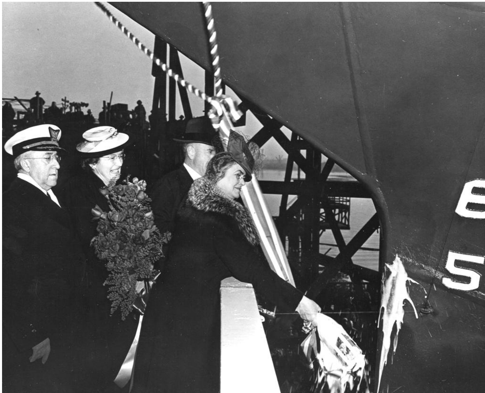
USCGC Northwind 's christening- 25 February 1945