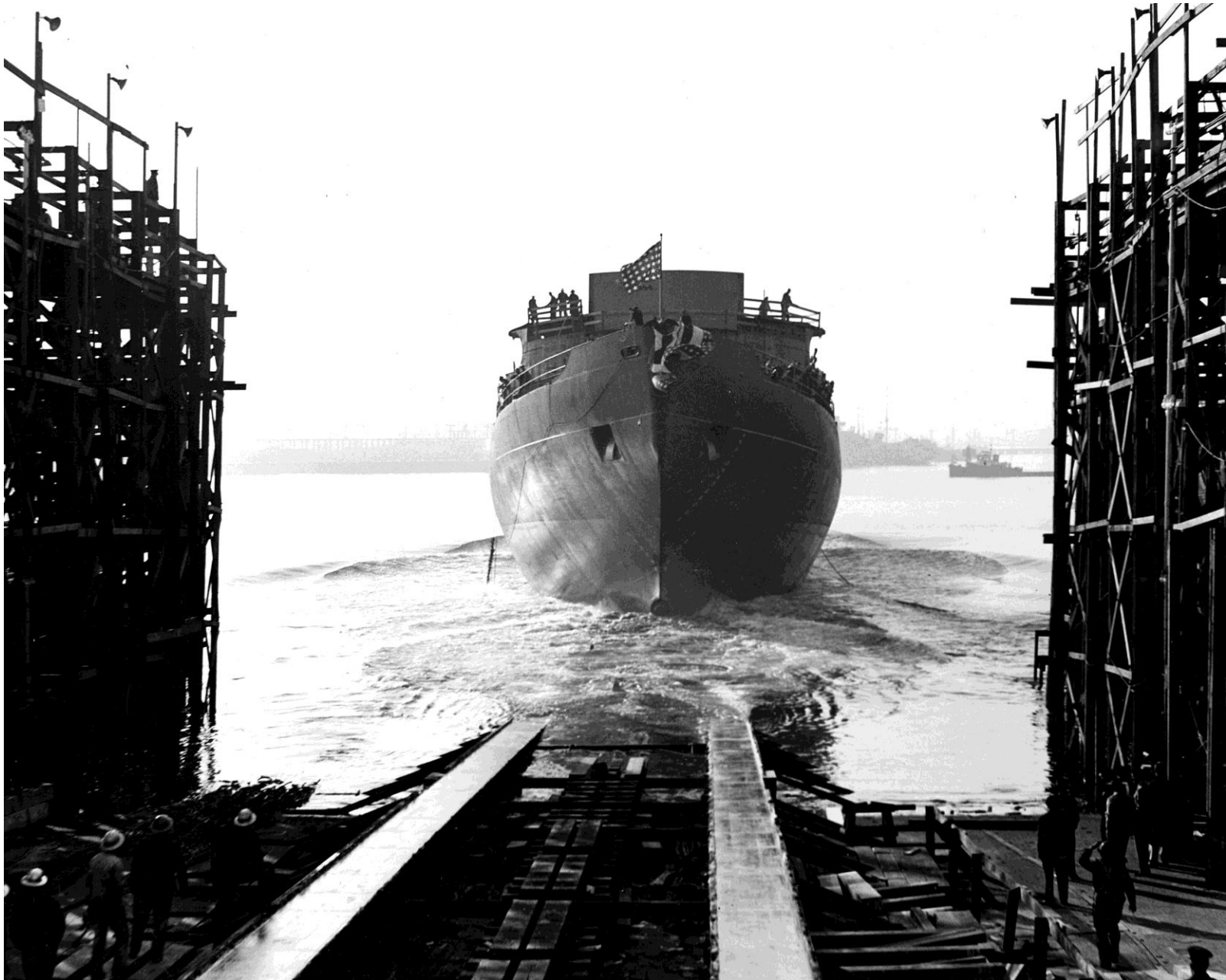
USCGC Northwind 's launching- 25 February 1945