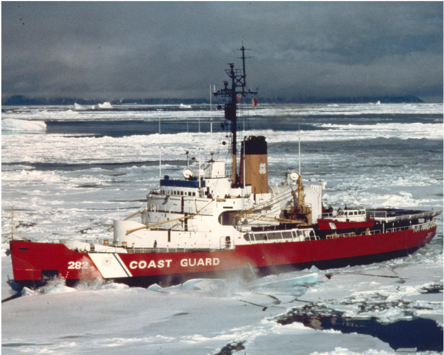
USCGC Northwind, 1986