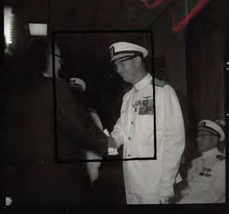
1 A SAFETY FILM