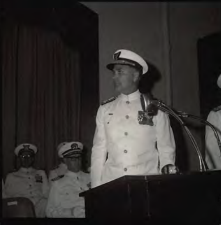
10 30 SAFETY FILM