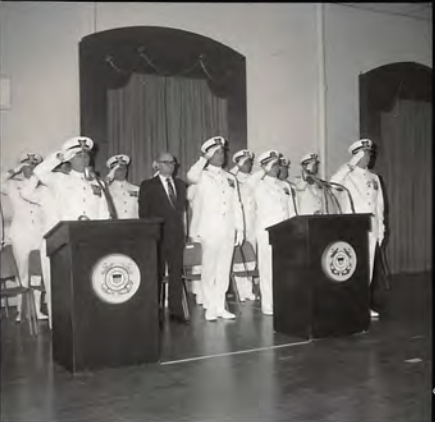
9 8 A SAFETY FILM