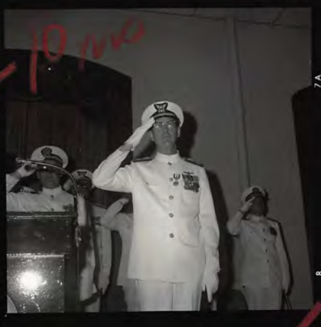
8 7 A SAFETY FILM