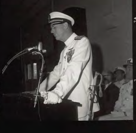
2 SAFETY FILM