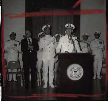
4 A 5 SAFETY FILM