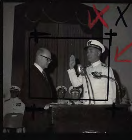
12 10 A SAFETY FILM