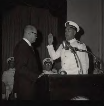
11 9 A SAFETY FILM