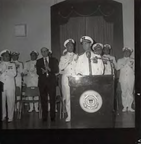
4 4 SAFETY FILM