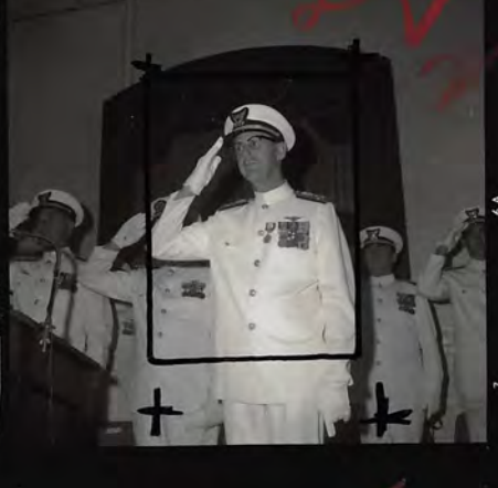
7 6 A SAFETY FILM