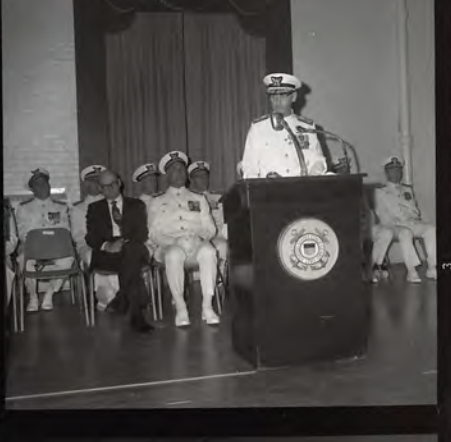
3 3 A SAFETY FILM