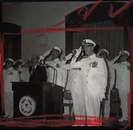
6 5 A SAFETY FILM