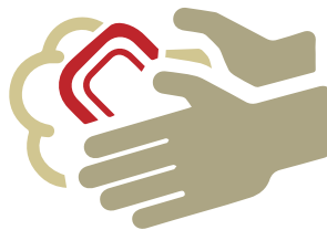
Enhanced personal hygiene and space cleanliness practices.