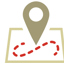
Restricted travel routes.