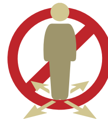
Restriction of Movement (ROM).

The most effective methods of containment once a unit has a COVID-19 case are strict isolation and quarantine. Each unit's circumstances will be unique, but all share the imperative to minimize instances of close contact or interaction to maximize the probability of prevention and containment. Prevention and containment tools are only effective if followed earnestly by every single member of the unit.