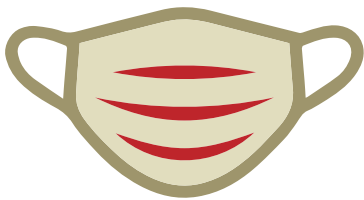
Cloth face coverings.

The most effective method of COVID-19 prevention is physical distancing to prevent close contact and dramatically reduce the risk of transmission. Close contact is currently defined as: being within 6 feet of a COVID-19 positive individual for more than 15 minutes; or, being coughed or sneezed upon by a COVID-19 positive individual. Additional prevention tools include: