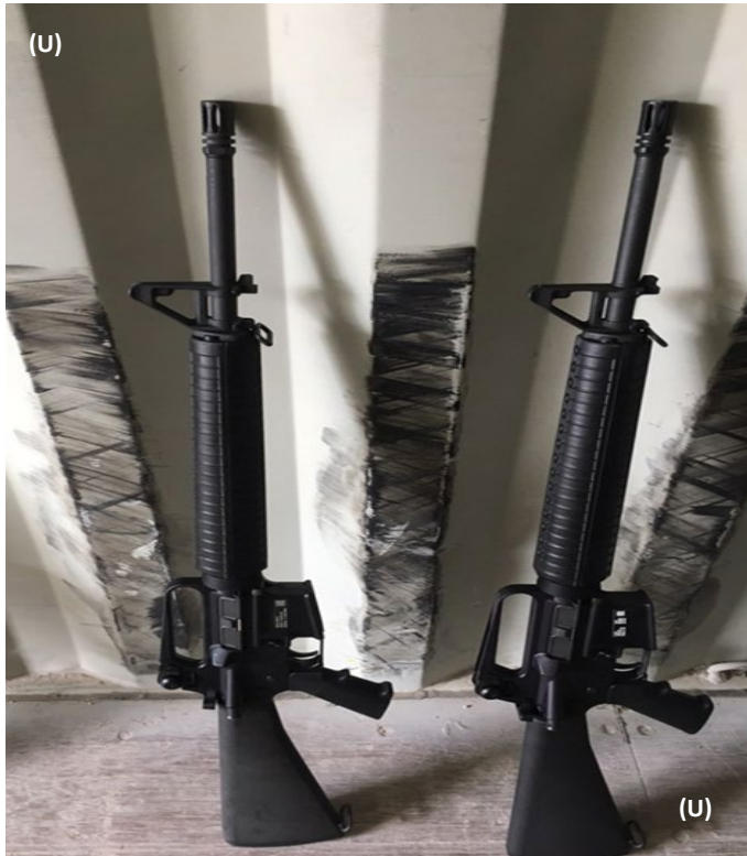
(U) Figure 1. M-16 Rifle