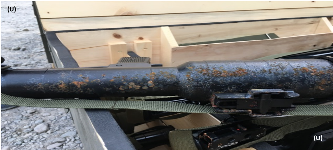
(U) Source: The DoD OIG.

(U) 1st TSC personnel stated that they did not have sufficient space to store all the equipment inside the warehouse and consequently had to store weapons and other equipment outside in metal shipping containers or wooden boxes. Furthermore, 1st TSC personnel stated that the metal shipping containers leaked and were not properly sealed. 1st TSC personnel stated that they informed SOJTF-OIR personnel of the overcrowding of the BPC Kuwait warehouse and that 1st TSC personnel had to store equipment outside the warehouse in metal shipping containers or wooden boxes.