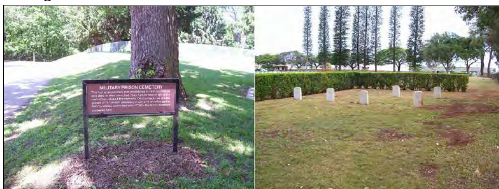
Figure 8. Fort Leavenworth and Schofield Barracks Cemeteries

authority for burial in a military installation cemetery is not clear. The U.S. Code (38 Chapter 24 Section 2411) does not explicitly state that felons are prohibited from