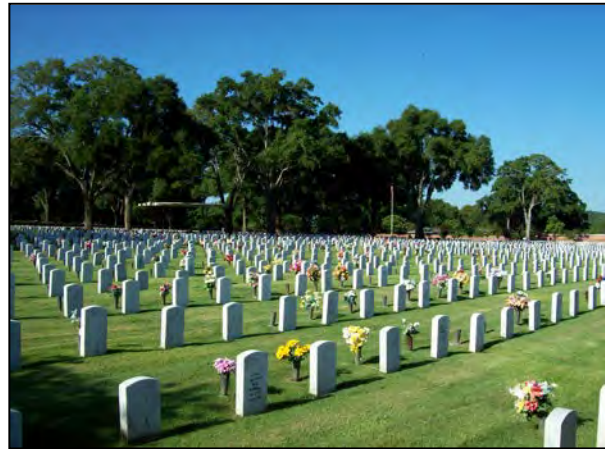
Figure 3. Cemetery with No Maintenance Issues

The lack of guidance from the Department of Defense regarding cemetery operations and administration and the Services’ failure to follow their own guidelines has contributed to variations in cemetery standards. The variation in cemetery operations was systemic; each Service had implemented their view of the interment process and was doing what it believed to be correct, but without cross-Service standardization. During our discussions with personnel from the Under Secretary of Defense for Personnel and Readiness, they discussed their plans to develop department-wide guidance on cemetery operations.