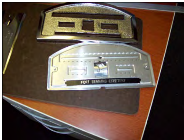
Figure 4. Temporary Grave Marker Used by Forts Benning and Leonard Wood

The Army and Air Force provided guidance on temporary markers, the Navy did not. For those that used temporary markers, practices varied among the installations (e.g. some sites had metal signs on the ground or stakes with general information written on paper). Inconsistent records led to discrepancies between the DA Form 2122 and the headstone, as well as with temporary markers that had been left in the cemeteries for multiple years without being replaced by a headstone. DA Pam 290-5 (4-17), states “The Superintendent reviews the suspense file each month. Follow-up action in writing will be taken if the headstone has not been received within 120 days after interment.” Oversight is required to ensure compliance with the requirement to replace temporary markers with permanent headstones. 34