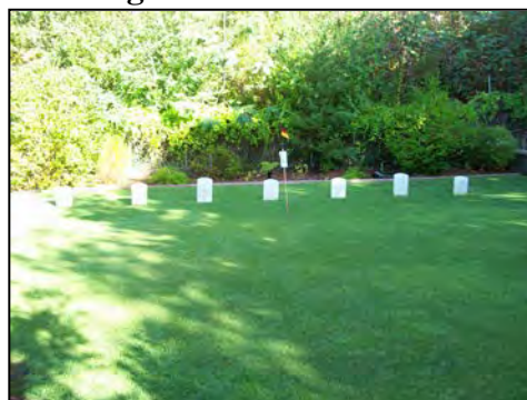
Figure 9. POW Graves

For the most part, there was no segregation of their graves from that of U.S. personnel. These graves are maintained to the same standard as the rest of the cemetery's population. Local German and Italian groups place flowers and flags commemorating their service during their respective nation's Remembrance Day.