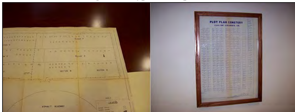
Figure 1. Types of Map Plats

Two Army publications 26 provided guidance on inspections. AR 290-5 specifically addressed both the Arlington National Cemetery and Soldiers' Home, while AR 210-190 addressed post cemeteries. The latter states that it is the installation garrison commander's responsibility to inspect annually. Other than stating an inspection is required, the Army did not provide any guidance on how or what needed to be inspected. The current inspection criterion for Arlington National Cemetery provides the scope of technical, operating, and administrative inspections. The Army may want to incorporate similar inspection criteria for the post cemeteries as is