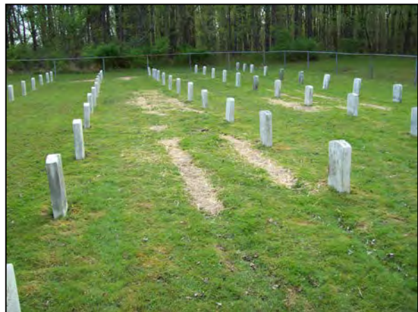
Figure 2. Tire Ruts in Cemetery

Two Army publications 27 provide guidance on maintenance of cemeteries. DA PAM 290-5 addressed the Arlington National Cemetery and Soldiers' Home, in addition to post cemeteries, and AR 210-190 addresses post cemeteries on Army installations.