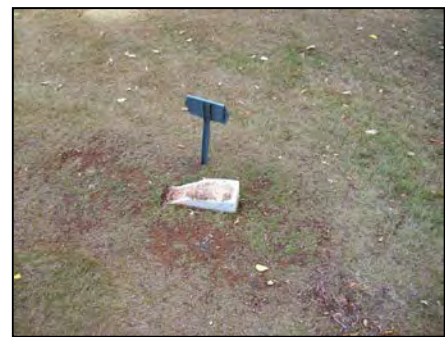
Figure 5. Headstone Destroyed by Improper Lawn Mowing Operations