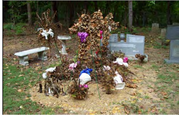
Figure 7. Civilian Grave in Civilian Cemetery on Military Installation

Two installations (Carlisle Barracks and Fort Sill) maintained cemeteries containing the interred remains of American Indians. Carlisle's cemetery contains remains of both American Indians (from the Indian school operated at Carlisle from the 1870s to 1918) and U.S. servicemen and their dependents. Fort Sill has five specific Indian cemeteries, in addition to the military cemetery. We found these Indian cemeteries to be maintained to the same standard as military cemeteries.