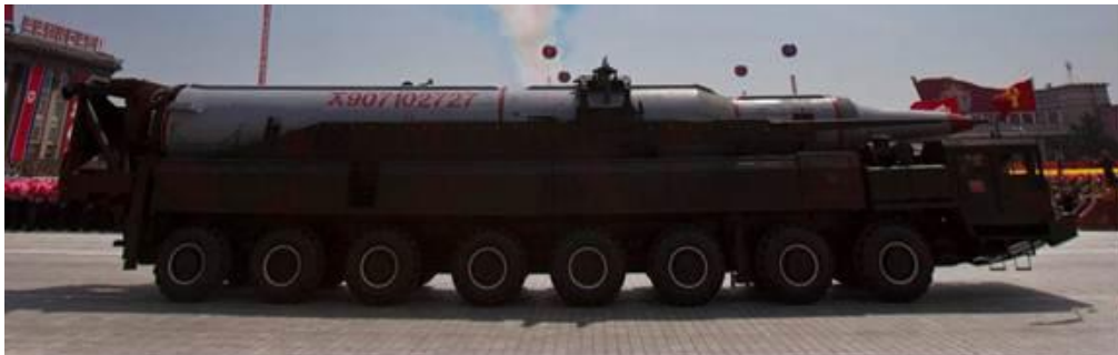
Figure 2: KN-08 external configuration.