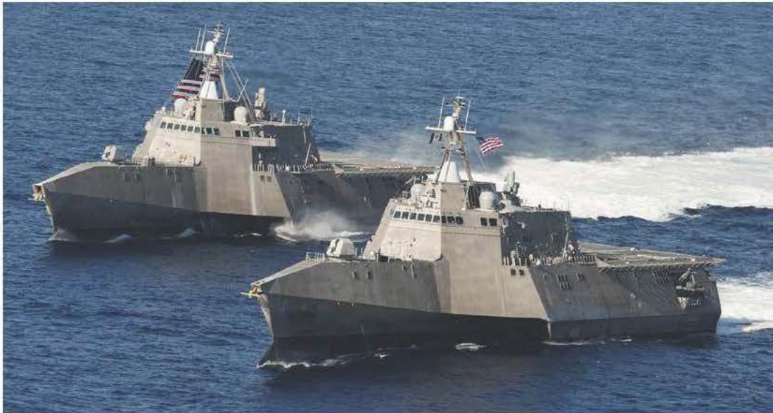
Figure. USS Independence (LCS 2), left, and USS Coronado (LCS 4)

In February 2002, the Navy initiated the Littoral Combat Ship (LCS) Program to develop a new class of ships for operations close to shore. The LCS primary missions are to counter shallow-water mine, surface, and submarine threats.