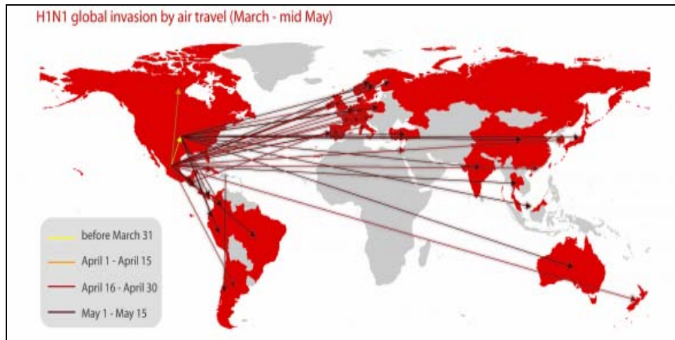
Figure 2. Spread of the 2009 H1N1 influenza strain was expedited by air travel. 19

The virus quickly gained the attention of world leaders and international health organizations. On April 27, speaking at the National Academy of Sciences’ annual meeting, U.S. President Barack Obama declared, “We are closely monitoring the emerging cases of swine flu in the United States. And this is obviously a cause for concern and requires a heightened state of alert.” 20 On the same day, the DoD announced that it was “monitoring the H1N1 flu situation closely, with its primary focus on protecting the military population.” 21 A Pentagon official said, “We certainly have a number of contingency plans for dealing with health incidences like this, because our primary goal is preservation of the fighting force.” 22 As part of previous infectious disease outbreak planning, military treatment facilities already stocked prescription