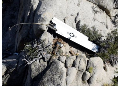
Figure 2 (Tab S-4)