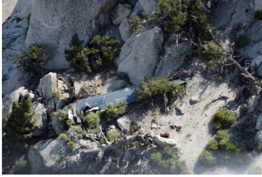
Figure 1 (Tab S-5)