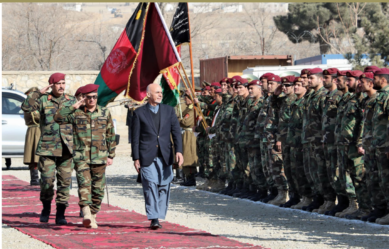
Afghan President Ashraf Ghani visits the Afghan National Army Special Operations Command at Camp Commando, Kabul.

actions and counter disinformation campaigns from other state and non-state actors that mislead the Afghan people and may undermine Afghan government progress and key initiatives.