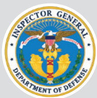
DoD OFFICE OF INSPECTOR GENERAL