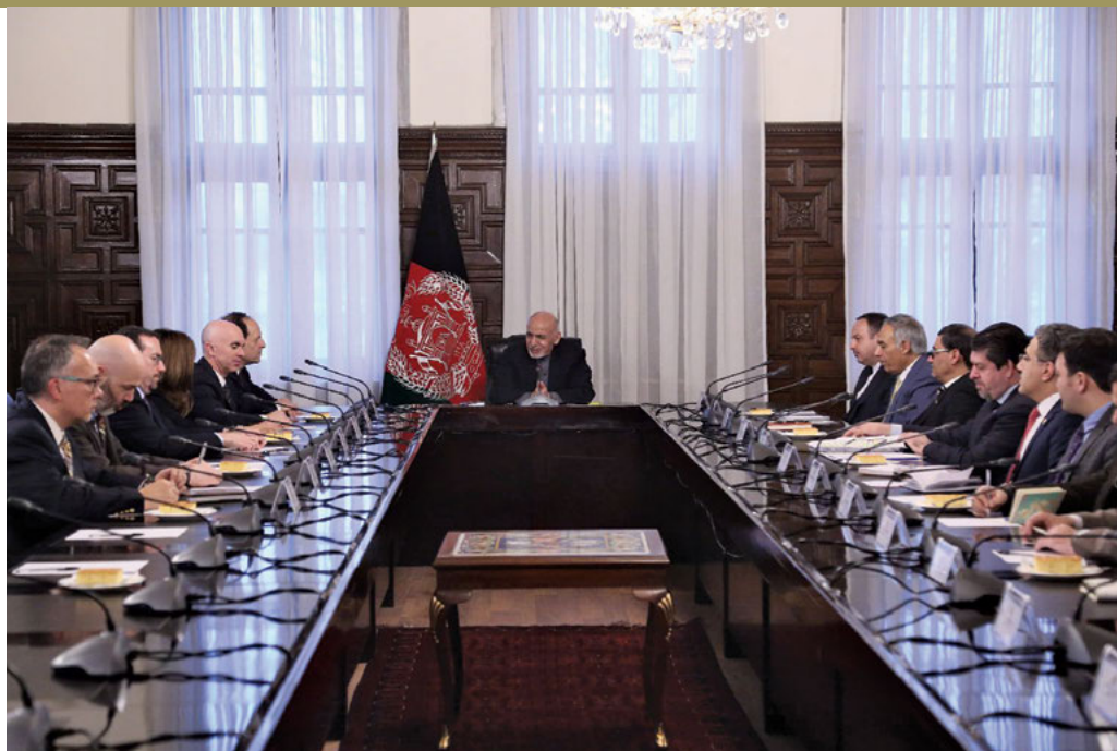
The Inspectors General responsible for Lead IG oversight meet with Afghan President Ashraf Ghani and his cabinet ministers in Kabul.