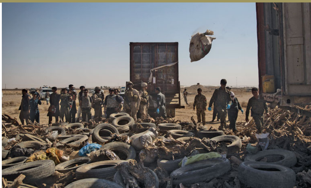
Afghan National Policemen unload confiscated drugs onto a pile of wood and tires during a controlled drug burn at Bost Airfield, Afghanistan. This periodic burn included opium, heroin, hashish, various chemicals, alcohol and morphine.

Afghan government. As has been widely discussed, the Taliban and other extremist organizations obtain safe haven and support in Pakistan. United States officials with whom we met stated that Afghanistan's ability to achieve peace or reconcile with the Taliban will be diminished if this continues. In addition to high-level diplomatic pressure on Pakistan, the United States recently withheld military aid to Pakistan, as it has previously. However, it remains unclear whether United States efforts under the new South Asia strategy will meaningfully alter Pakistan's behavior.