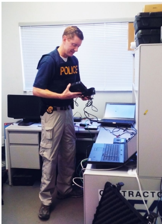
DCIS agent conducting a cyber investigation

Our independence is key to fulfilling our mission. We align our work with the critical performance and management challenges facing the DoD. We focus on program efficiency, effectiveness, cost, and impact. We regularly follow-up on our recommendations to ensure that the DoD implements these recommendations. Implementation of our recommendations helps promote accountability and continuous improvement in the DoD.