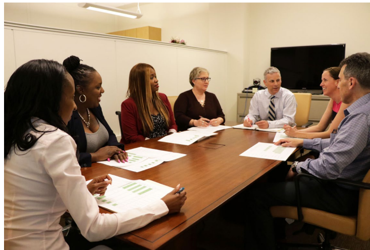
DoD OIG auditors engaged in a pre-audit planning session

We are a diverse and engaged team, empowered to help improve DoD programs and operations through timely, credible, relevant, impactful, and actionable oversight. Central to this vision is our people. We strive to be an employer of choice, ensuring our people are well-trained, well-equipped, and engaged. We are committed to a culture of performance, disciplined execution, and tangible results. We work together as One OIG to achieve results.