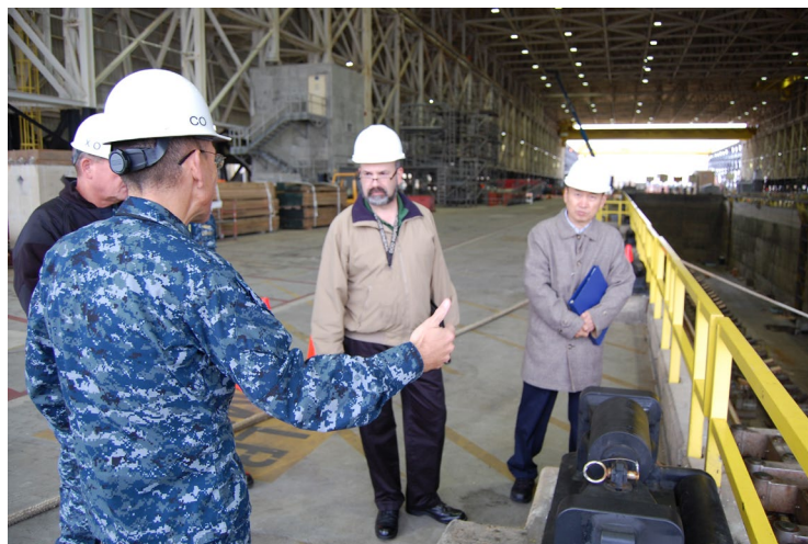
DoD OIG evaluators listen to the Commander of the Trident Refit Facility, Kings Bay Georgia.

We deliver results through timely, high quality, and impactful oversight. We seek to ensure that the DoD is a good steward of its resources. We execute our mission with skill, a sense of urgency, and in accord with applicable professional and technical standards. We regularly seek to improve our organization, our competencies, and our work.