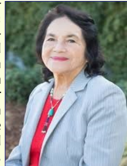
Ms. Dolores Huerta