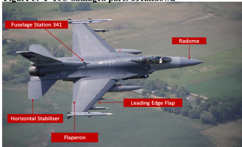
Figure 5: F-16C damaged parts breakdown

MA1 received damage during the midair collision to its right leading edge flap, the right outboard wing, the outboard flaperon, and the right horizontal stabilizer (Tab J-37). MA1 upon impact broke into two sections near the Fuselage Station 341 just forward of the installed engine (Tab J-7). Post impact analysis deemed MA1 a total loss (Tabs J-5 and P-4).