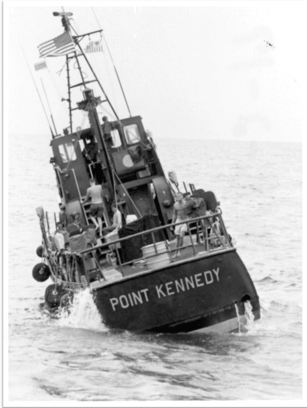
Point Kennedy demonstrates a WPB's stability in relatively calm seas.