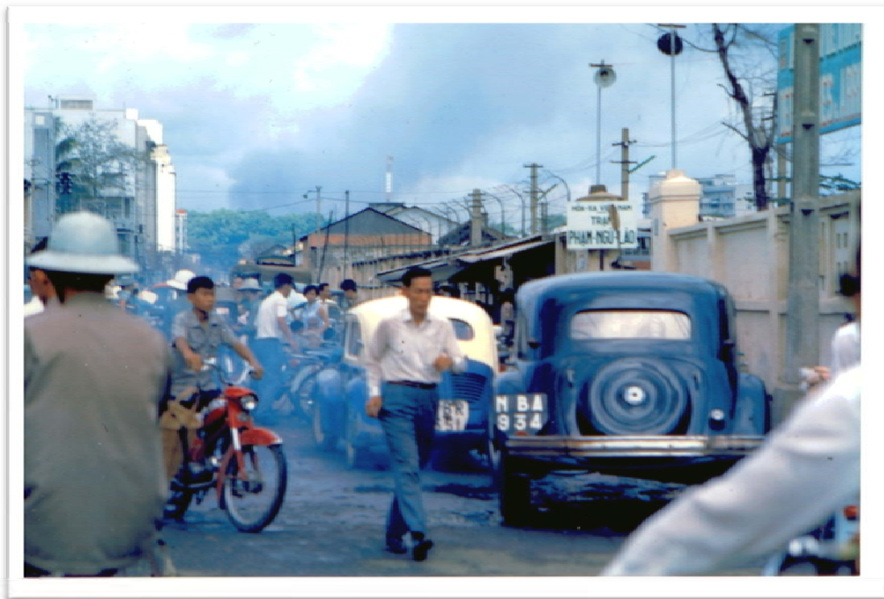
“Peaceful” Saigon on 8 May 1968 with air strikes on the horizon.

One difference was our use of the 13-foot Boston Whaler to go into rivers and canals, sometimes following sampans that headed for shallow water to evade the WPB. While there were multiple dozens of small-boat operations; we provided gunfire support for the Special Forces outpost a few are easy to recall. One nighttime foray ended with engine failure inland of a river mouth being closed off by a shore-to-shore mud bank when the tide went out. The three of us spread our flak jackets and squatted on them, two in front pulling and one pushing from behind. We could slide the 13-footer about three feet, then reset everything and do it again. After getting to enough water to float the boat, we used the seats to try to paddle out to the Point Banks . Skipper White eventually had to drive the cutter into the shallows to get us safely onboard.