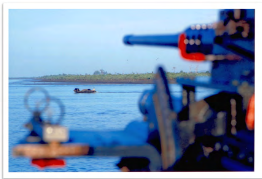
A sampan passes the watchful eyes behind the Point Banks bow mount.

civilian refugees streaming down the road. On the second day I was able to beg some jungle greens and get out of my dress khakis. Day three brought an opportunity to send a note to CGHQ via a passing Army jeep convoy. As I suspected, HQ had not been told I was coming. They managed to get another Army patrol to bring me into Saigon. I must have looked like hell as they quickly got me a place to shower and sleep.