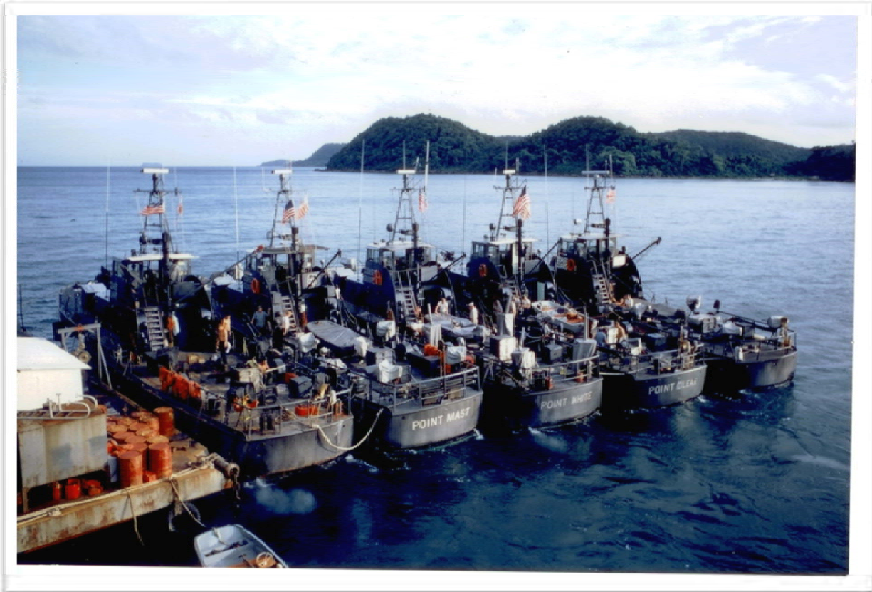
“The Nest” alongside a Navy barge in An Thoi Island harbor.

Another excursion was much further up a river in the company of a second Whaler. We came across some kind of outpost that we destroyed, but then began hearing small arms fire. The single engine spotter aircraft that was flying cover thought they were the target and left the scene. With no observer and well inland with heavily overgrown shorelines, we tried to stay “on plane” all the way back to the coast.