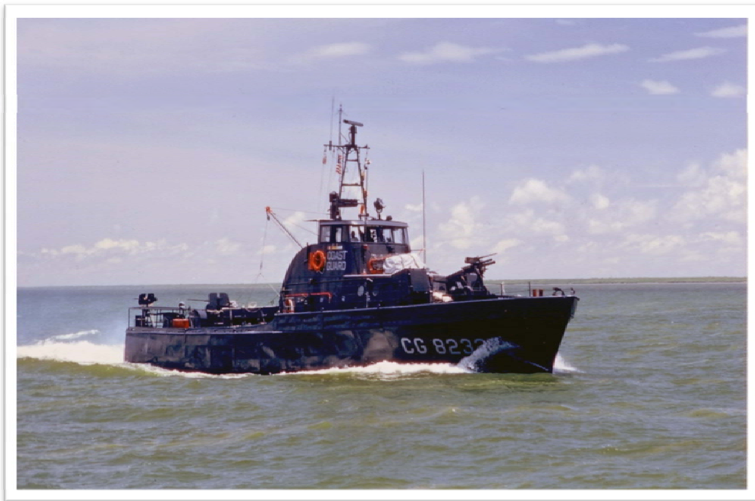
Point Banks freshly painted after dry dock in Cam Rahn Bay

I had the distinct pleasure of serving with one of the finest crews in Squadron One, on board the USCGC Point Banks [WPG-82327] from 9 May until 23 October in 1968. However getting there was nowhere near "half the fun."