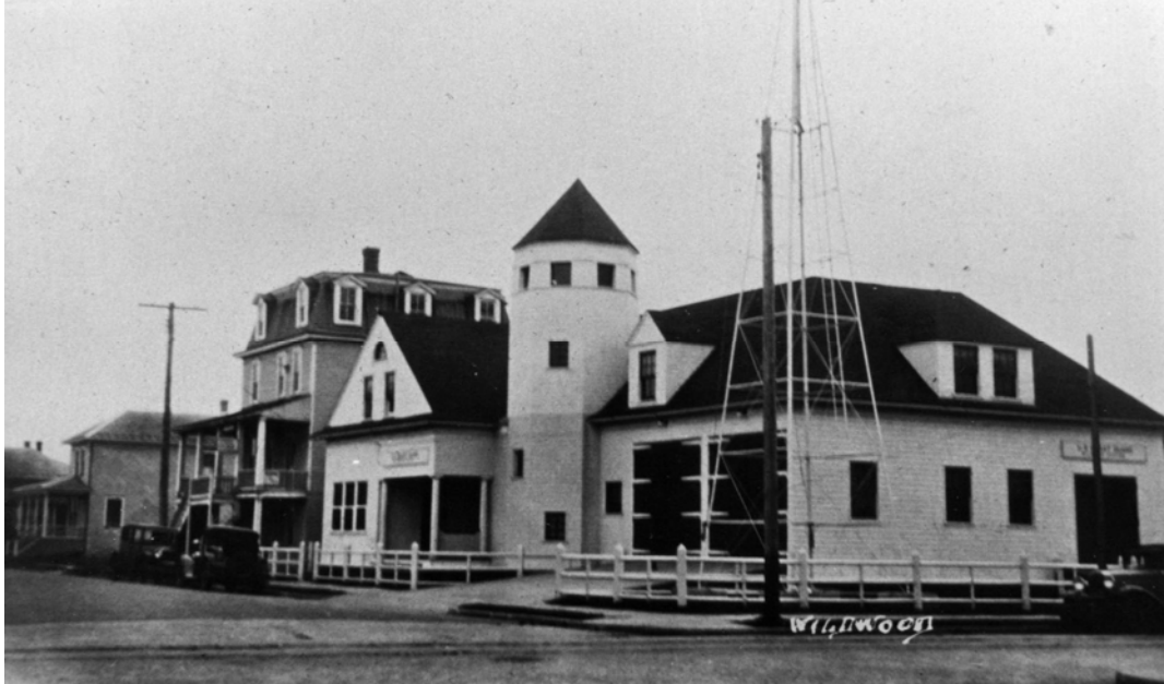
"Wildwood"; no date/photo number; photographer unknown.