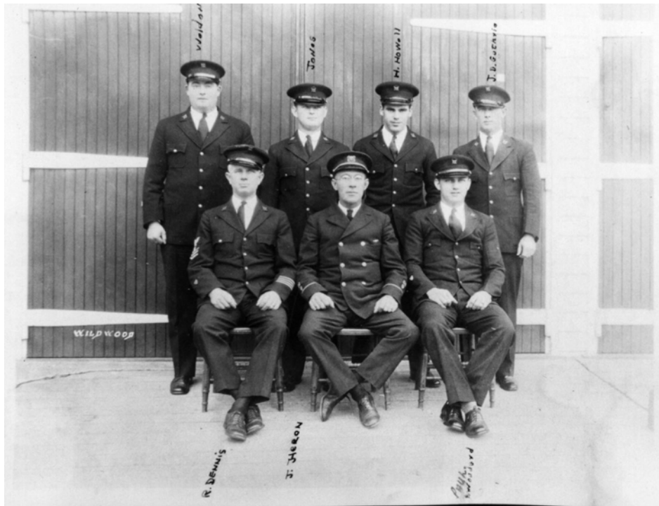
"Wildwood"; no date/photo number; photographer unknown.