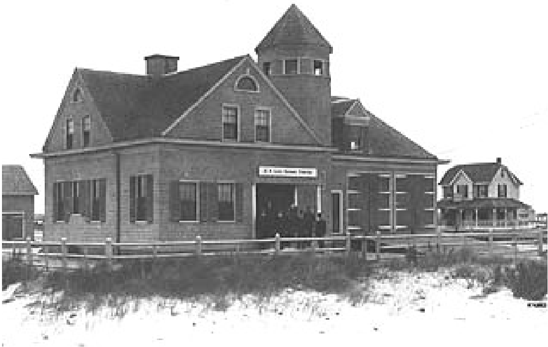
No official caption/photo number; photographer unknown; dated 1915.