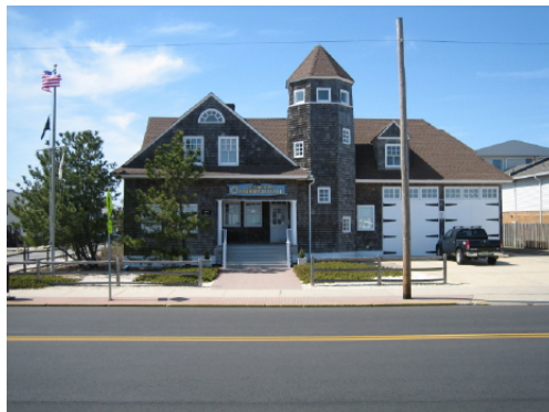
Seaside Park Borough Hall