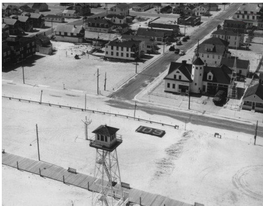
No official caption/photo number; photographer unknown; dated 1945.