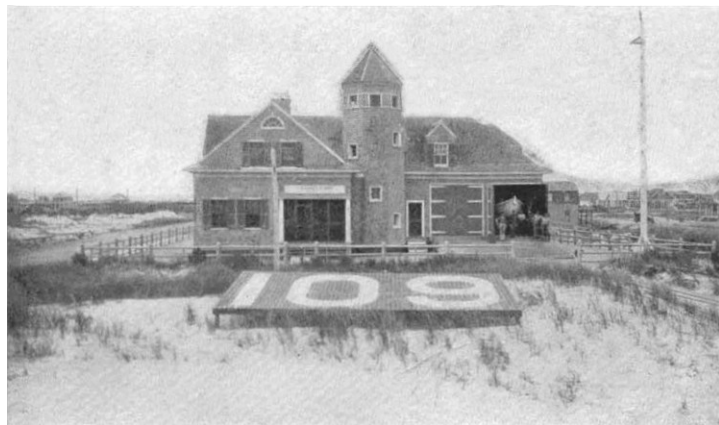
No official caption/photo number; photographer unknown; dated 1917.