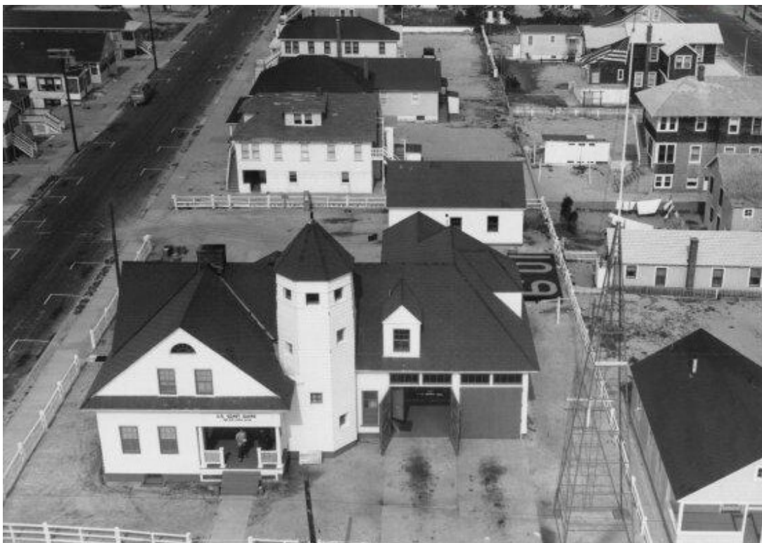
No official caption/photo number; photographer unknown; dated 1945.