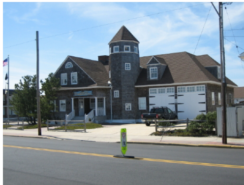
Seaside Park Borough Hall