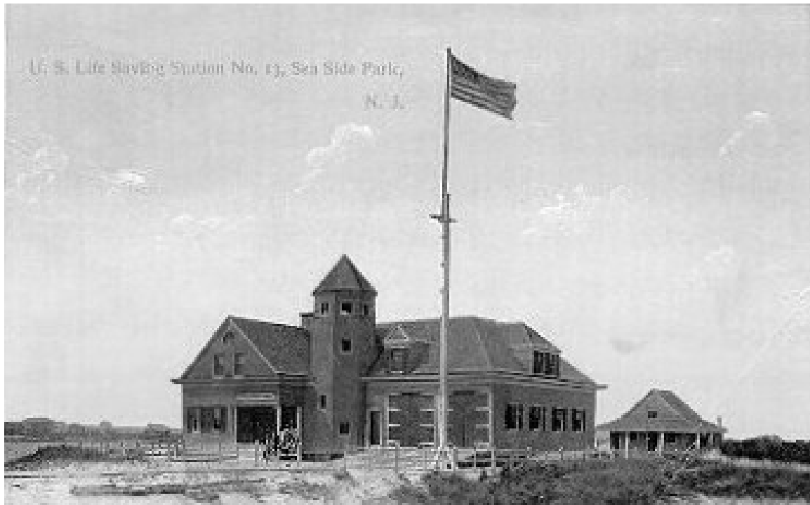
"U.S. Life Saving Station No. 13, Sea Side Park, N.J. No date/photo number. Postcard image.

CGM (L) L. T. Camburn was officer-in-charge in 1936.