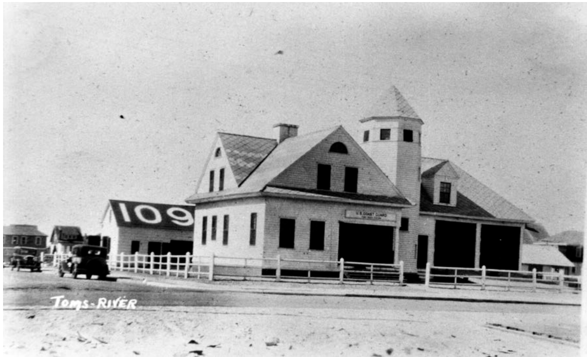
"TOMS RIVER"; no date/photo number; photographer unknown; courtesy of Van Field.