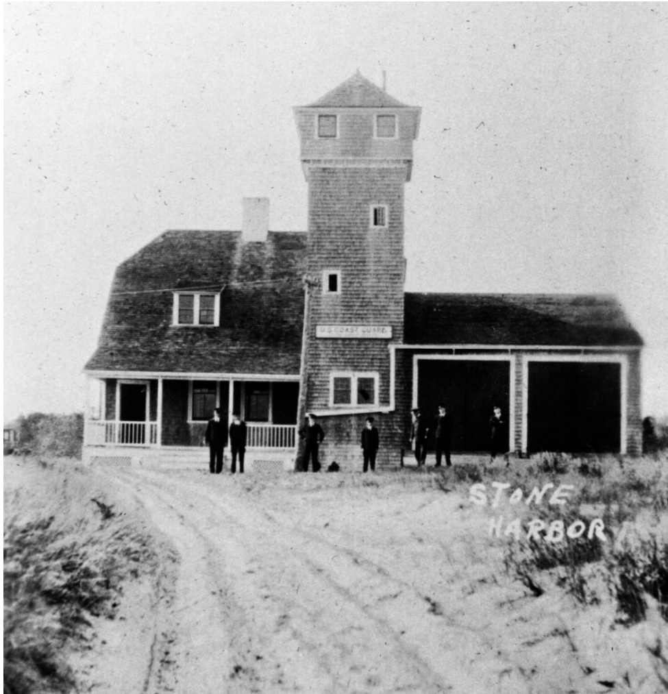
"STONE - HARBOR"; no date/photo number; photographer unknown. Courtesy of Van R. Field.