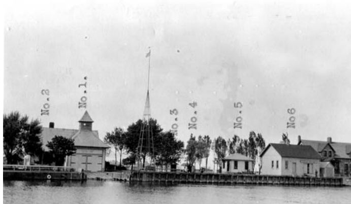
Sheboygan in 1916