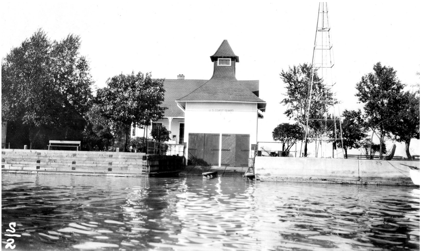
Changes in the Boathouse