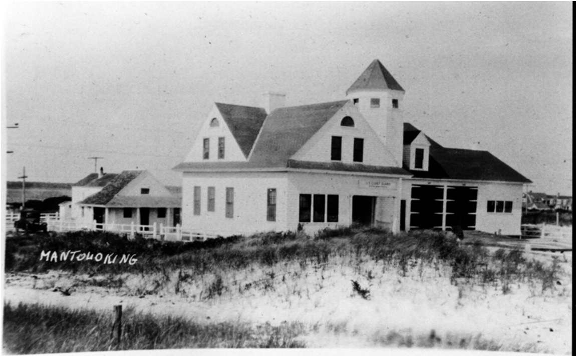
No caption/date/photo number; photographer unknown. Probably 1930s.