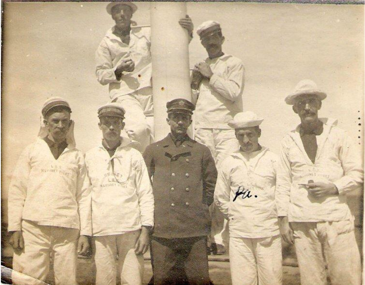
Manomet Life Saving Station USLSS Manomet, Massachusetts