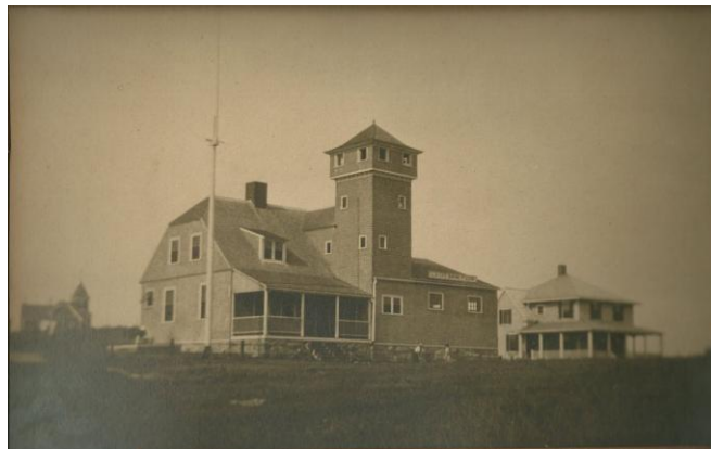
Manomet Life Saving Station USLSS Manomet, Massachusetts

Outside Photo Plaque, on Frame: "August 22, 1909"