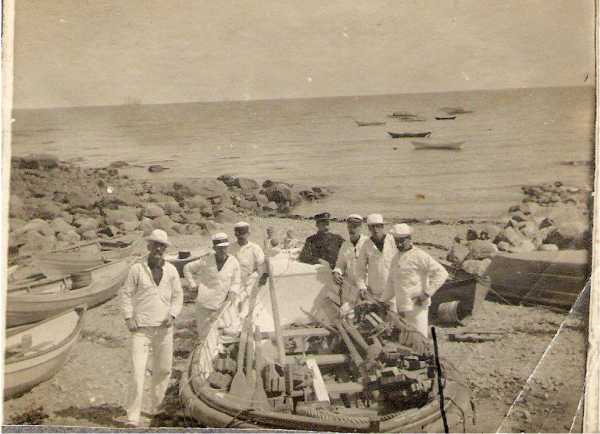
Manomet Life Saving Station USLSS Manomet, Massachusetts