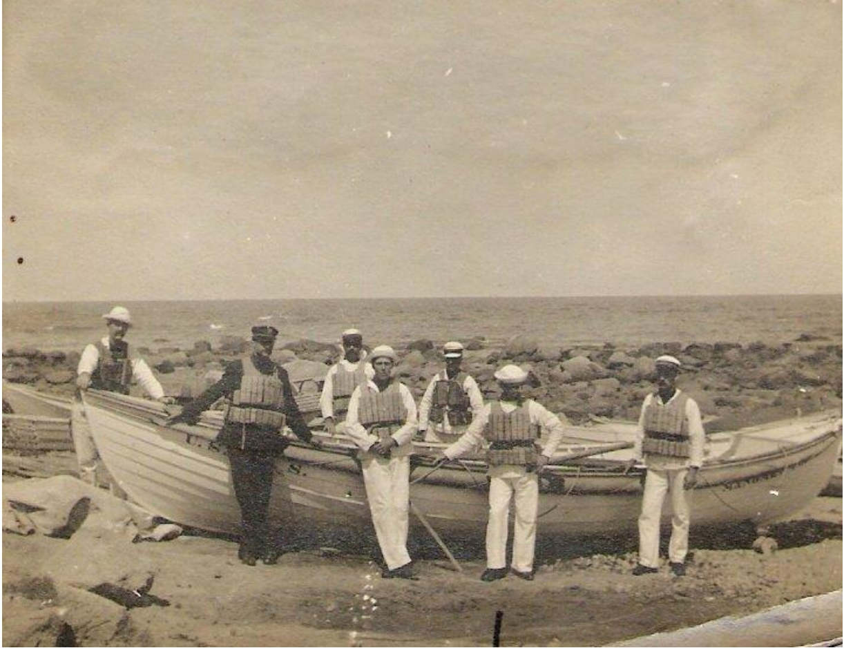
Manomet Life Saving Station USLSS Manomet, Massachusetts