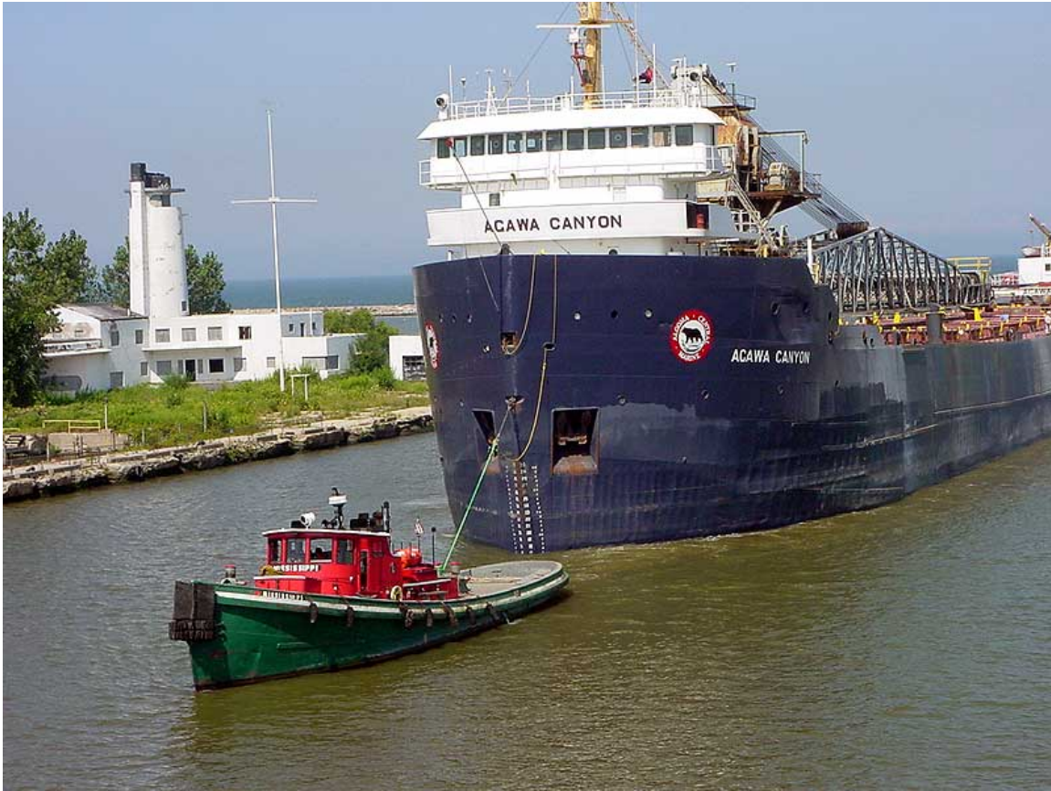
View of the abandoned Cleveland station, circa 2000.