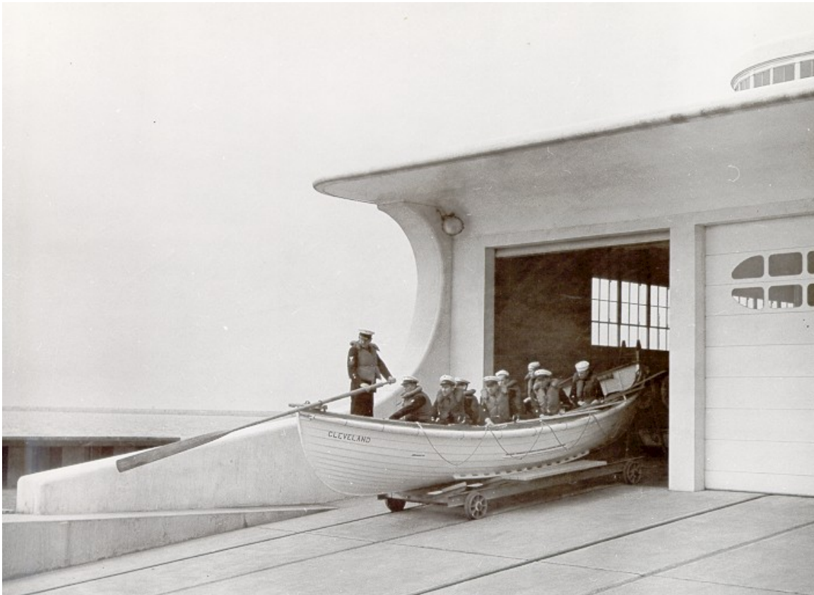
Original caption reads: "SEMPER PARATUS AT CLEVELAND LIFEBOAT STATION."; Surfboat crew in position as boat rolls from boathouse to water. This method of launching is one of the numerous means employed by the Coast Guard to spread rescue crews on their way immediately upon receiving a distress call."; 19 March 1948; Photo No. 5191; photographer unknown.