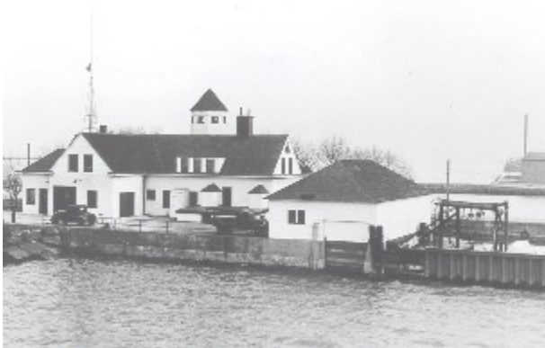
Station Cleveland circa 1933

USLSS Station 8, Ninth District Coast Guard Station #239