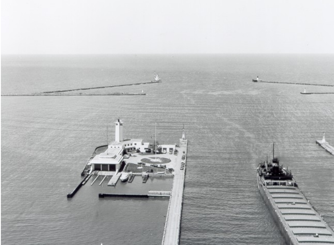
No caption/date/photo number; photographer unknown. Aerial view of the station, circa 1968.