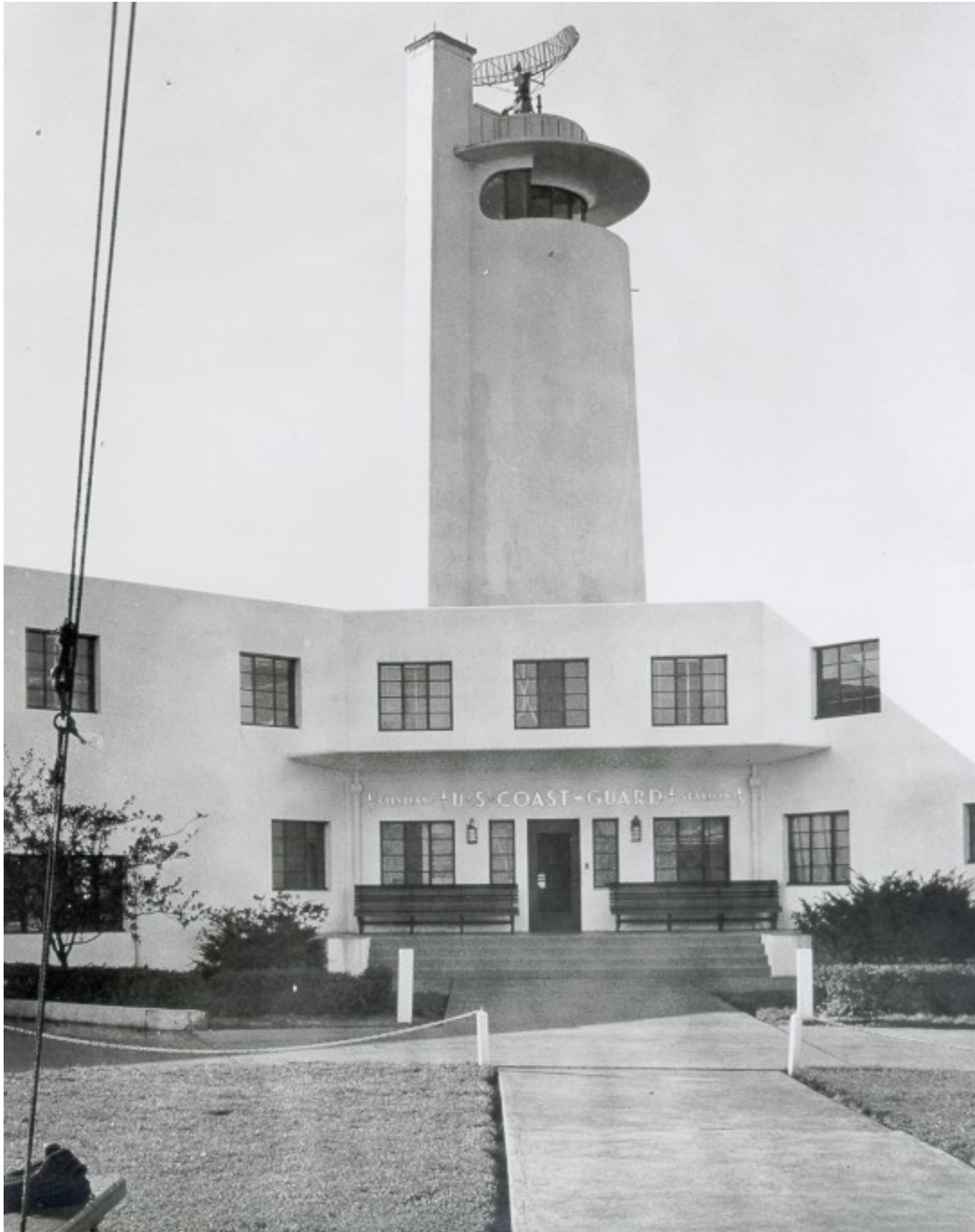
No caption/date/photo number; photographer unknown. A close up of the station's entrance and lookout tower. Note the radar antenna.