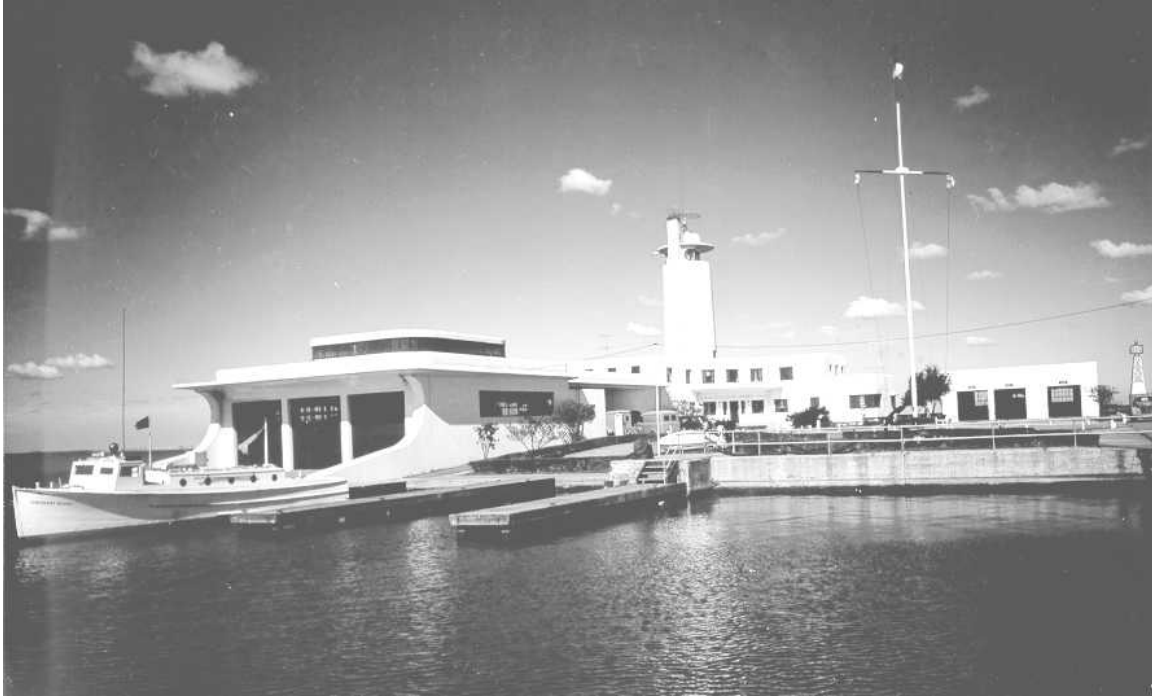
Original caption reads: "CLEVELAND LIFEBOAT STATION, Cleveland Lifeboat Station is situated at the mouth of the Cuyahoga River. One of the most modern structural designs of Lifeboat Stations on the Great Lakes. The Cleveland Lifeboat Station was established in 1873 and the modern station built on an improved island in 1939 and 1940."; April, 1953; Photo No. 04075302; photographer unknown.