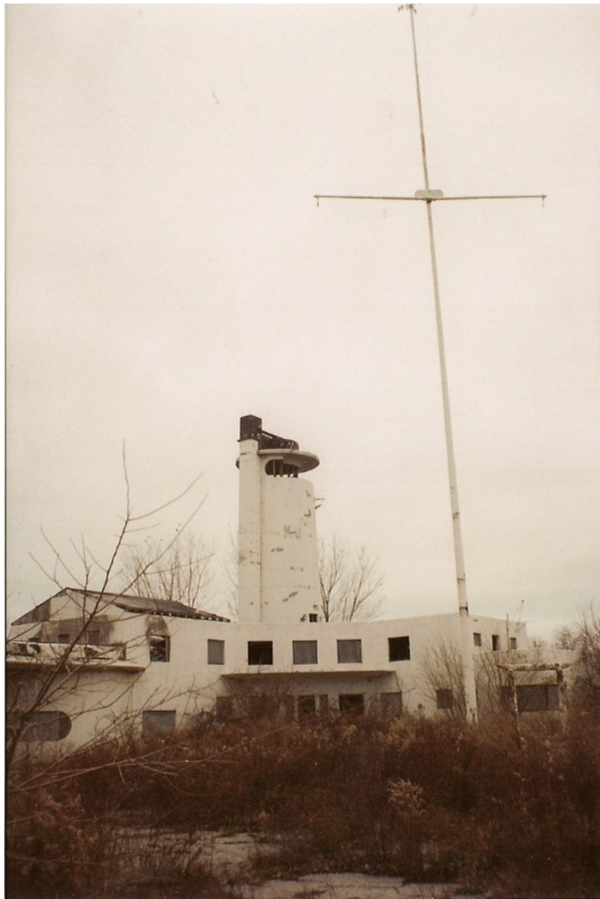
View of the abandoned Cleveland station, circa 2000.