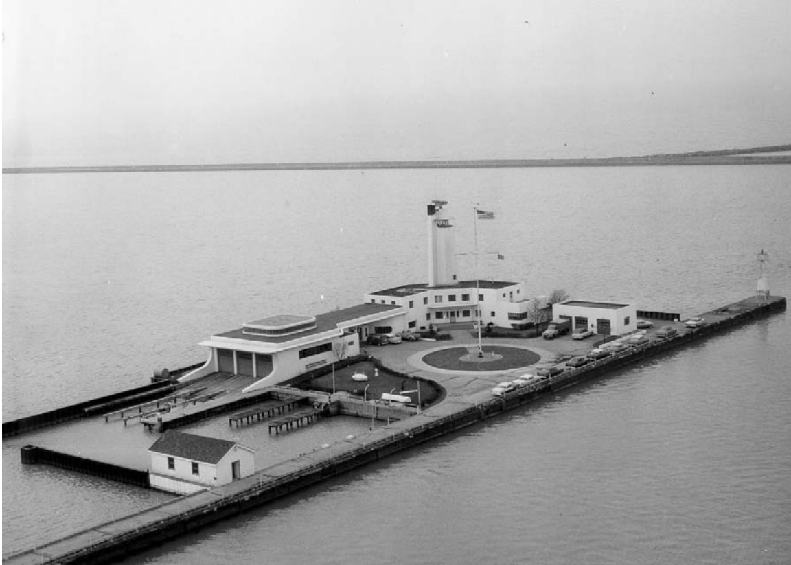
No caption; 15 February 1951; Photo No. CG 121559 03