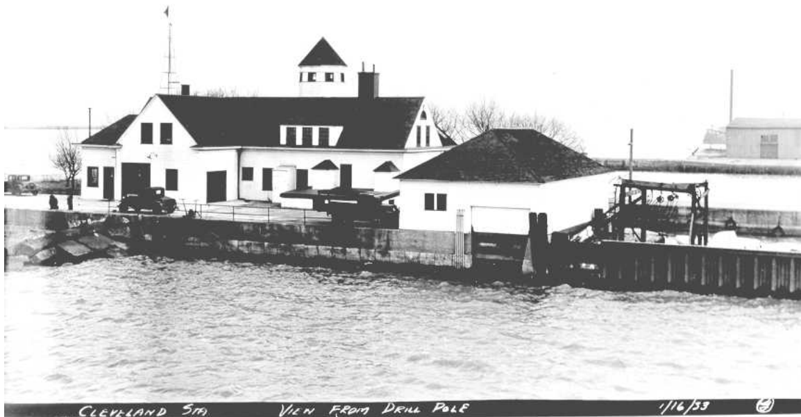
Original caption reads: "Cleveland Station, View From Drill Pole"; photo dated 16 January 1933; no photo number; photographer unknown.