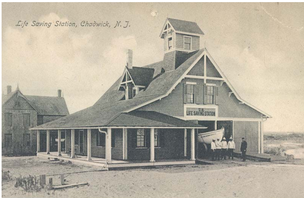
Life Saving Station, Chadwick, N.J.

Postcard image, early 20 th Century, photographer unknown.