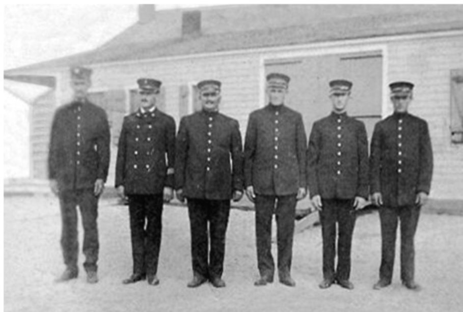
CEDAR CREEK STATION #110 (circa 1912)