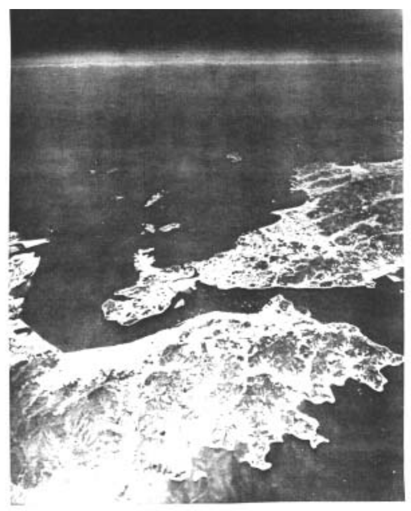
Fig. 5: Aerial Photograph of Japan's Shimonoseki Strait

The Navy is gratified at being able on Army Day to congratulate the XXI Bomber Command on its outstanding achievement in completing the very effective mining operations reported yesterday. This project, like all your operations to date, has been executed with precision and determination which arouses our admiration. It is a definite contribution toward winning of the war.<sup>24</sup>