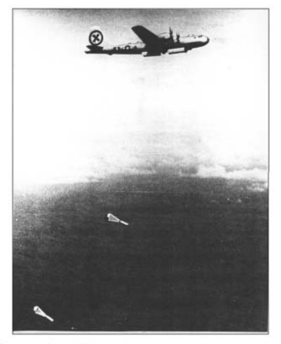
Fig. 4: Aerial Mining from a 313th Bombardment Wing B-29 (USAAF Photo, 1945)

Operation Starvation was a five-phase campaign that began on March 27th. The Joint Target Group, in Washington, D.C. completed target prioritization--a task begun by the COA, which it replaced. Phase one had the dual aim of serving as a strategic blockade while lending tactical support to the Okinawa invasion by hindering Japanese naval reinforcement. The idea was to mine principal shipping bottlenecks heavily and force the enemy to concentrate their limited sweeping capabilities to clear narrow channels. Small areas cleared of mines, once detected by reconnaissance, could be reminded using the continuous efforts of a smaller attacking force. Mining would then spread to progressively distant locations and further tax the minesweepers by using a variety of mine types.<sup>19</sup> Although four missions involved 100 B-29s of the 313th Bomb Wing in a "maximum effort,"most of the