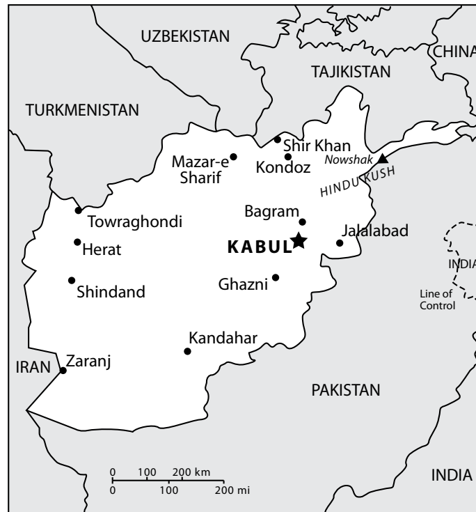
Figure 2. Map of Afghanistan. (Reprinted from General Libraries, University of Texas, 18 March 2002, http://www.lib.utexas.edu/maps/cia02/afghanistan_sm02.gif .)

bus bombing in Egypt that killed nine German tourists. 22 Other attacks that did not materialize during this time period were plots to assassinate Pope John Paul and to blow up six US 747s over the Pacific. 23