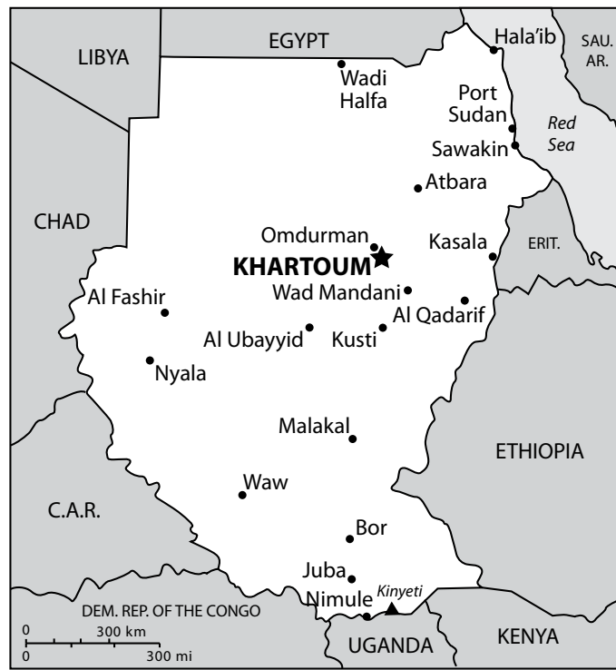
Figure 3. Map of Sudan. (Reprinted from General Libraries, University of Texas, 18 March 2002, http://www.lib.utexas.edu/maps/cia02/sudan_sm02.gif .)

Several Islamic entities supported al-Turabi, who headed Sudan’s National Islamic Front (NIF). 25 For example, Iran sent political specialists, while Iraq sent military officers. 26 Osama bin Laden was introduced to the NIF by the Iranians and lived in Khartoum (fig. 3) from 1991 to 1996. 27