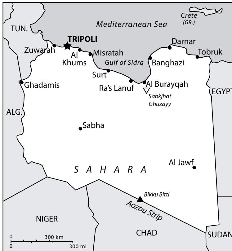
Figure 1. Map of Libya. (Reprinted from General Libraries, University of Texas at Austin, 18 March 2002, http://www.lib.utexas.edu/maps/cia02/libya_sm02.gif .)

“line of death” (see fig. 1), Weinberger “concluded that we would have to ignore these claims, and continue planned exercises for that region.” 6 On the night of 18 August 1981, Libyan SU-22 fighters engaged two US Navy F-14s that were below the line of death and were promptly shot down. 7 Tensions continued to rise until 1986 when the US Navy began its 19th exercise in the area since 1981. It was the eighth time that American forces would operate below the 32 degrees 30 minutes line. 8 On 24 March portions of the US Navy’s Task Force 60, under the command of Vice Adm Frank B. Kelso, crossed Gadhafi’s line of death. 9 This time Gadhafi chose to defend his claimed territory in earnest. When the US Navy decided to depart above the line of death three days later, it left behind several sunken Libyan warships, as well as one destroyed SA-5 missile battery. 10 President Reagan reminded the world that “the American exercises in the Gulf of Sidra were standard procedure. So it wasn’t an unusual thing we set out to do. And he did open hostilities and we closed them.” 11 Says Weinberger, “Qaddafi now turned to the use of terrorism to try to secure some advantage and escape from the continued humiliation he suffered as the world perceived how idle were his threats, and unequal his courage, for taking any military action to match his words.” 12