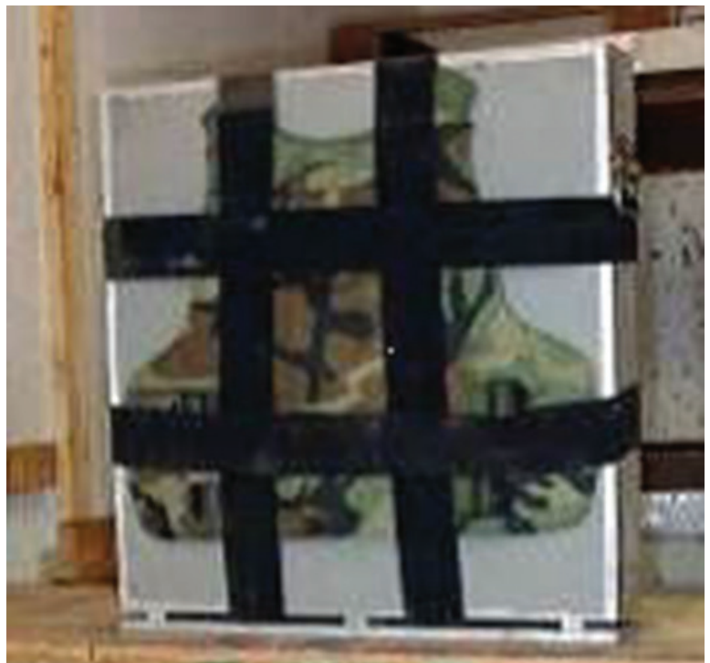
Figure. Test Sample Mounted for Ballistic Testing

We provided a discussion draft. No written response to this report was required, and none was received. Therefore, we are publishing this report in final form.