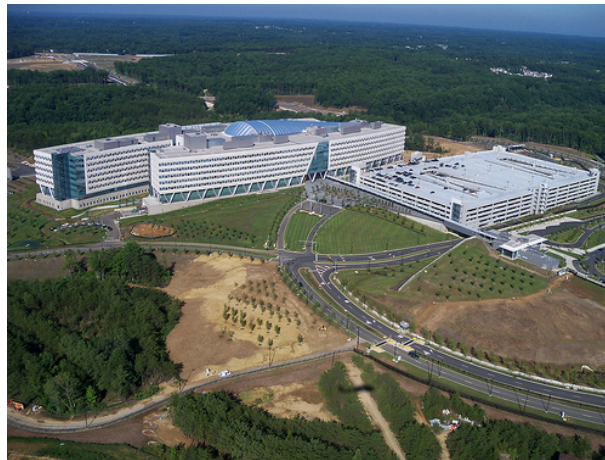
Figure 1. NGA Campus East

Figure 1 presents an aerial view of the completed NCE.