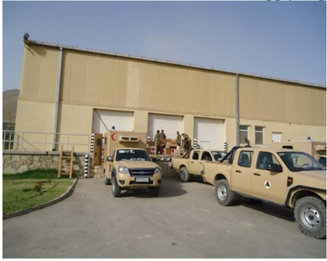
Figure 4. Afghan National Army Unit Accepting a Shipment of Pharmaceuticals From the National Supply Depot

LOGCOM officials effectively prepared pharmaceuticals for issuance. On September 27, 2011, we observed LOGCOM officials prepare a pharmaceutical shipment for issuance to a local ANA unit. Upon receipt of a MoD Form 14, "Request for Materiel," LOGCOM officials stated that they filled the request based on the inventory on hand. LOGCOM officials provided copies of both the MoD Form 14, and the MoD Form 9, "Issue and Turn In," to the authorized official designated to receive the pharmaceuticals. ANA unit personnel accepting the shipment also had the required gate pass for authorization to exit the NSD in accordance with stated procedures. Figure 4 shows the local ANA unit accepting a shipment of pharmaceuticals from the NSD.