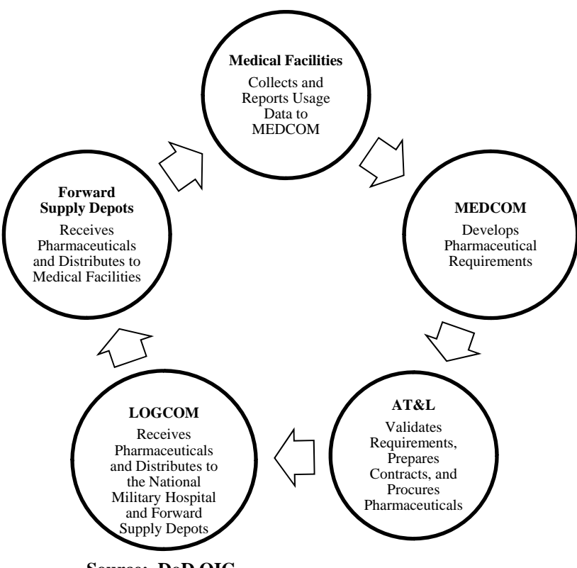
Figure 1. ANA Components and the Flow of Pharmaceuticals in the New ANA Distribution Process

Acquisition, Technology, and Logistics (AT&L), and the Logistics Command (LOGCOM). Figure 1 represents the ANA components and their responsibilities in the new pharmaceutical distribution process.