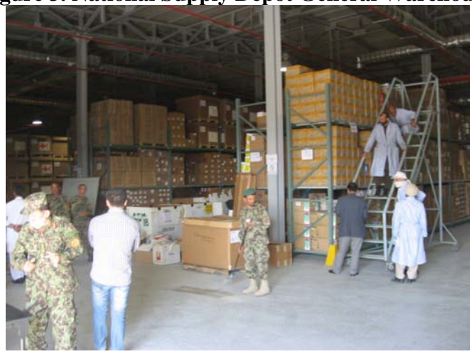
Figure 3. National Supply Depot General Warehouse