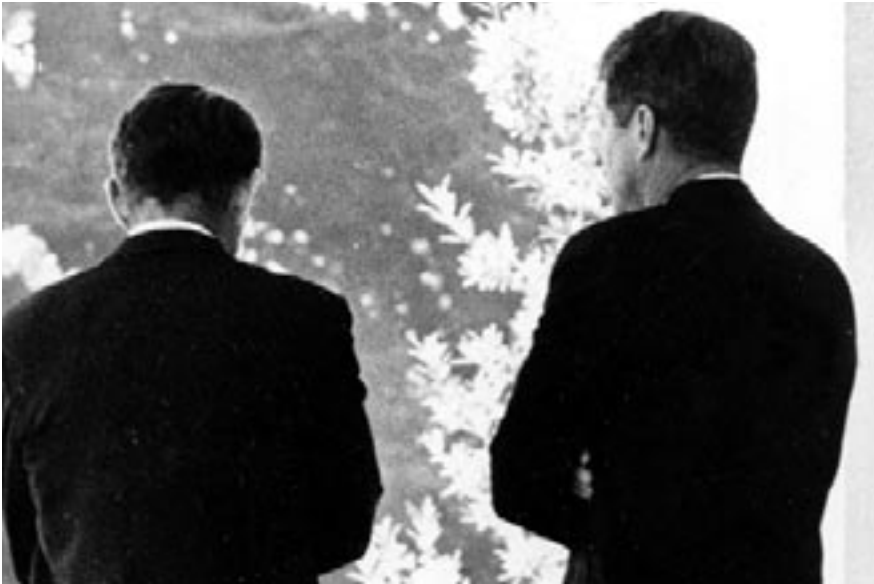
President Kennedy (right) and his brother Robert, the attorney general, confer during the 1962 crisis. Kennedy recognized the courageous efforts of the reconnaissance pilots and crews for helping resolve the crisis.

There was some talk of a “surgical strike” to take the missiles out, but with the capabilities and bombing accuracies of the day, that was not to be. The Air Force told the President that it would take hundreds of sorties to be sure of getting 90 percent of the missiles.