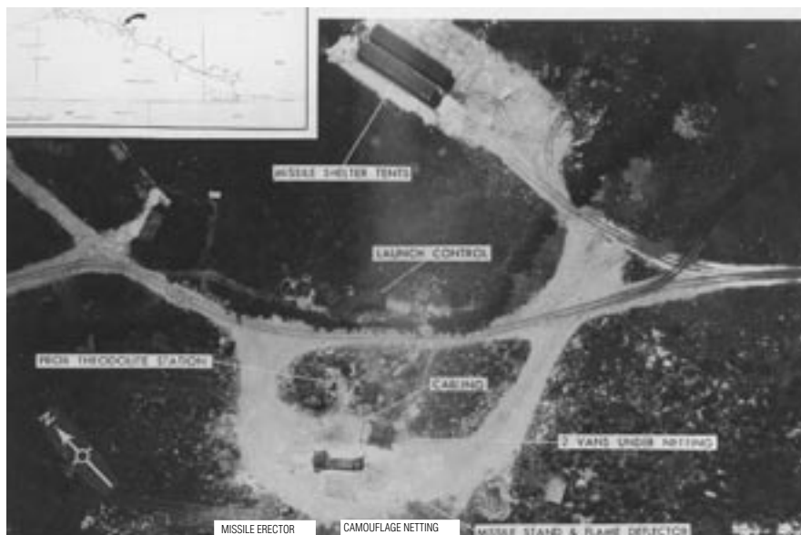
Anatomy of a crisis: At the top are the SS-5 missiles, housed in long tents. At the center is a launch control building, surrounded by service roads, missile erectors, and camouflage netting.

On Oct. 12, the Administration transferred responsibility for U-2 overflights of Cuba to the Air Force. Various reasons were given, but the real explanation was that the Administration did not want another CIA U-2 flap and believed that it would be easier to concoct a cover story if the missions over Cuba were flown by the Air Force.