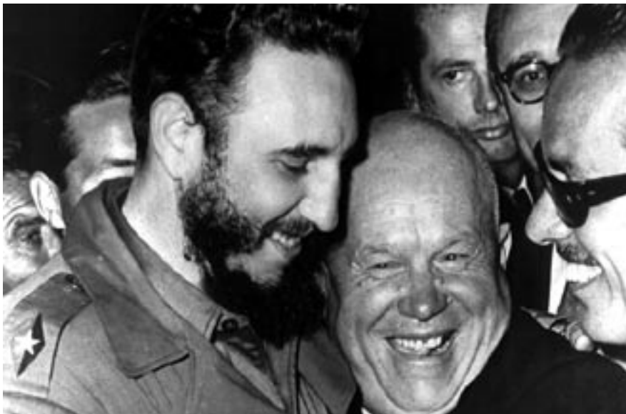
Castro (left) knew the missiles might provoke a US invasion of his country, but he was anxious to be a player on the world stage. Khrushchev (right) believed the missiles could be installed and hidden before the US knew what was happening.