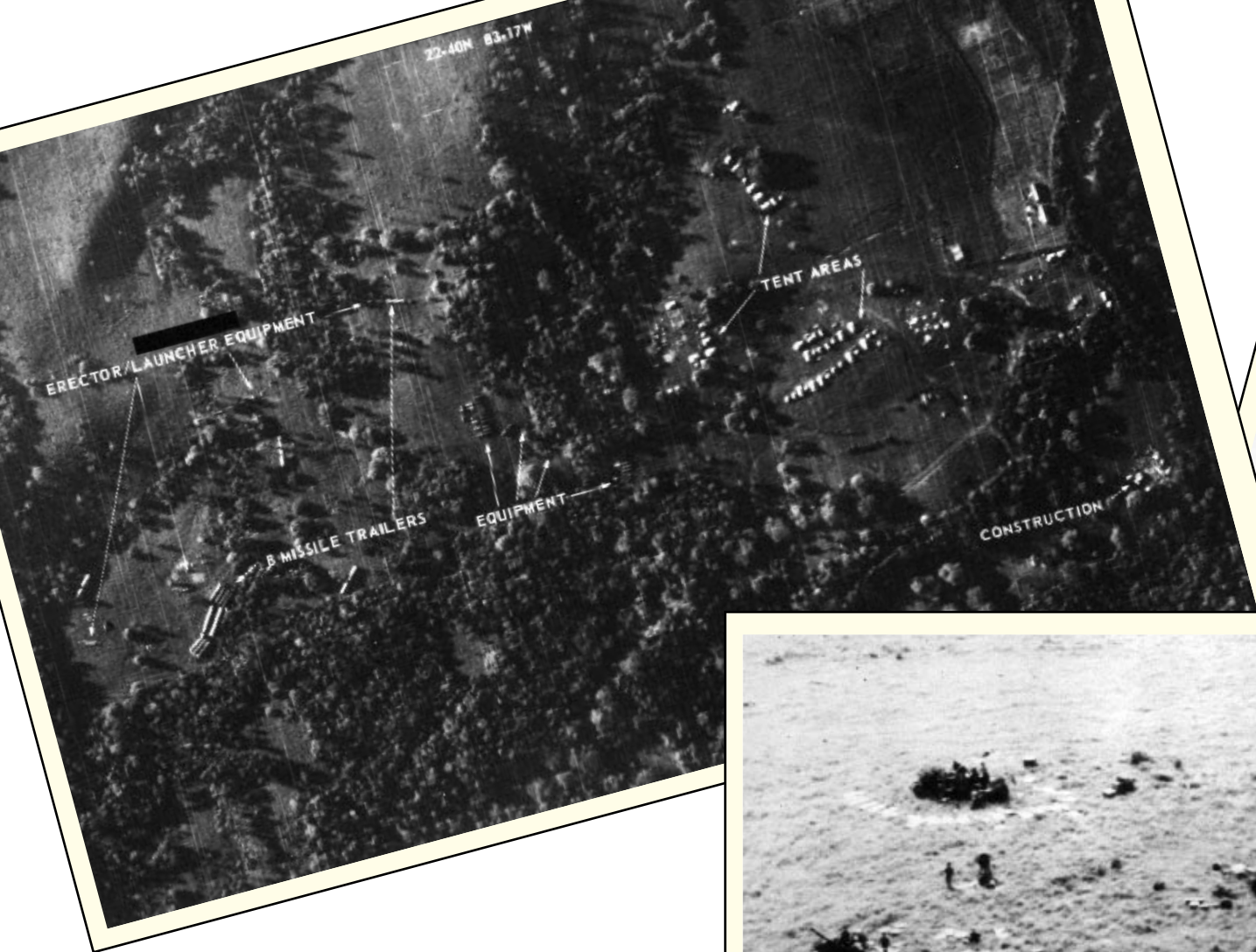
This "smoking gun" reconnaissance photo of San Cristobal, Cuba (above), revealed the presence of Soviet medium-range ballistic missiles. It was obtained by a high-flying U-2 spyplane such as the one at far right. A low-flying Air Force RF-101 or Navy RF-8 snapped the close-up at right of anti-aircraft artillery and radars being erected near the missile sites.