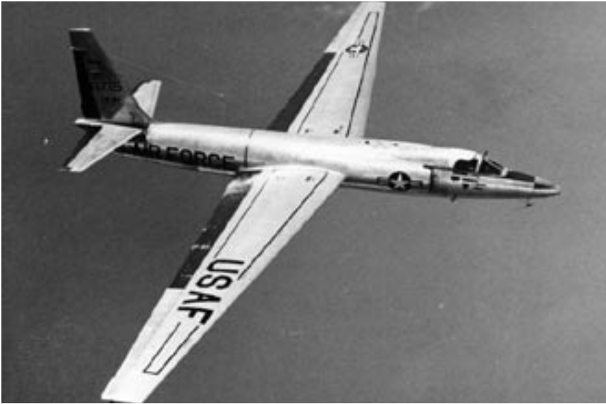
Maj. Rudolf Anderson Jr. was shot down while piloting a U-2A like this one. The U-2 Cuba mission had been passed from the CIA to the Air Force. Kennedy didn't want another Gary Powers-like flap if a CIA airplane went down.

Oct. 14. One reason was bad weather, but another was anxiety on part of the President's advisors, who worried about the consequences of a U-2 shootdown.