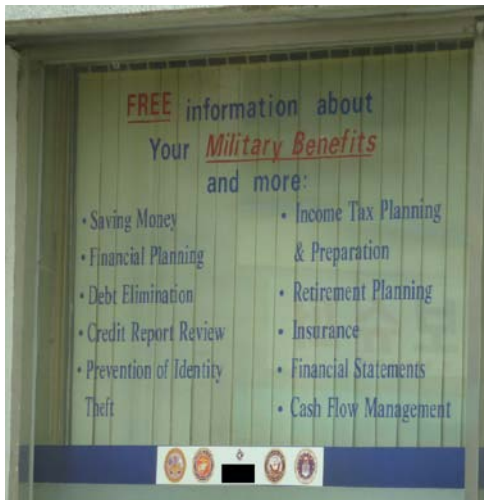
Figures 1 and 2. Storefront Windows Outside of Camp Casey, Korea

We went to the insurance agent's office outside the gate at Camp Casey where the six soldiers had purchased the insurance products. As enticement for soldiers to enter the establishment, the storefront offered free financial planning and income tax preparation assistance. In addition, the storefront displayed statements such as "free information about your Military Benefits," and "win a $500 AAFES gift card" (see Figures 1 and 2). After our visit, responsible officials at Camp Casey informed us the agent's office had closed.