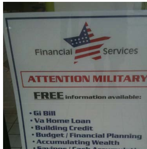
Figure 3. Storefront Display at Mall Near Sheppard Air Force Base

In summary, the storefront displayed a sign leading to possible confusion regarding sponsorship and affiliation with the U.S Armed Forces, which violates States' insurance regulations, and which may have confused or misled Service members. Financial counseling services are available at every Airman and Family Readiness Center free of charge (provided by all Services in respective member and family centers).