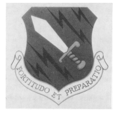
21st COMPOSITE WING

Lineage. Established as 21st Fighter-Bomber Wing on 15 Nov 1952. Activated on 1 Jan 1953. Inactivated on 8 Feb 1958. Redesignated 21st Tactical Fighter Wing on 19 May 1958. Activated on 1 Jul 1958. Discontinued, and inactivated, on 18 Jun 1960. Redesignated 21st Composite Wing, and activated, on 6 May 1966. Organized on 8 Jul 1966.