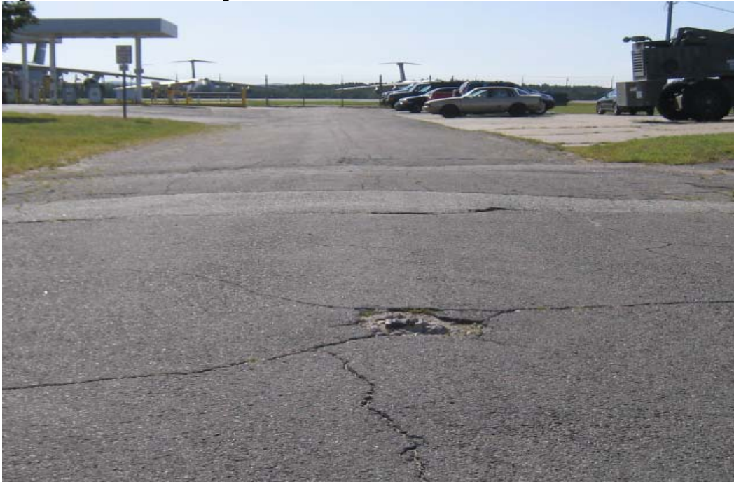
Figure 2. Deteriorated Asphalt

also prepared drawings for the construction area and developed cost estimates. Figures 2 and 3 document the condition of the asphalt service roads and C-5 aircraft apron.