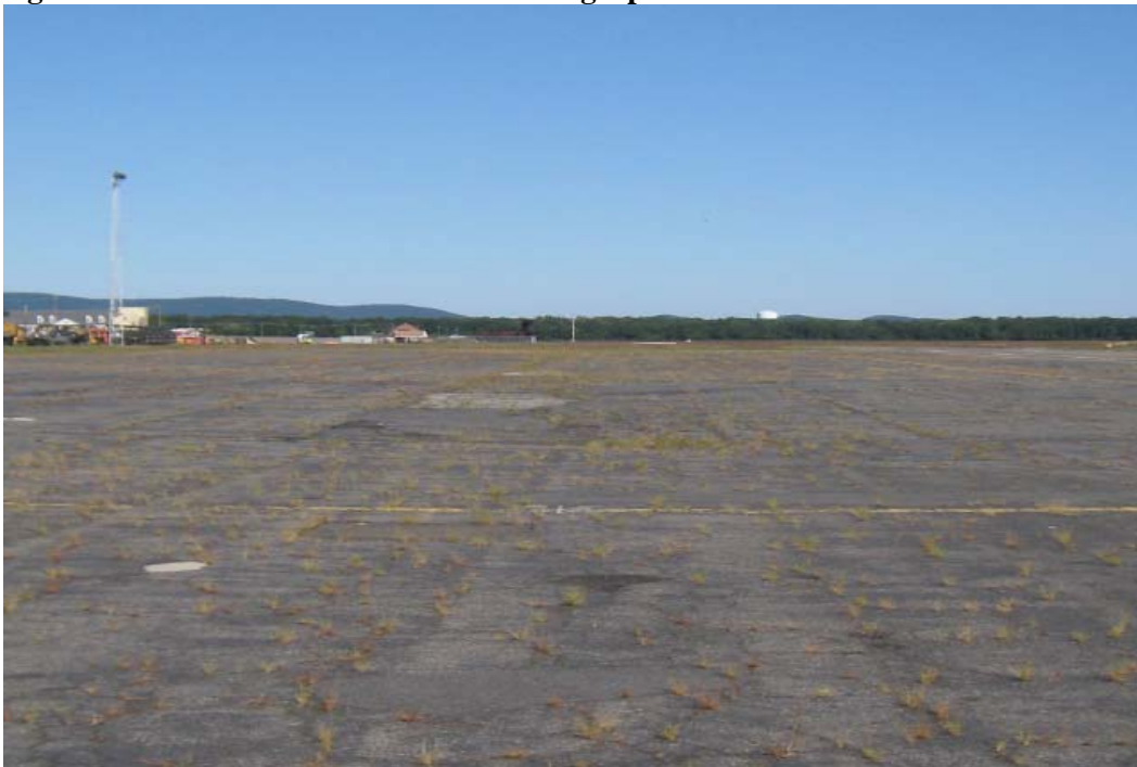
Figure 3. Deteriorated C-5 Aircraft Parking Apron