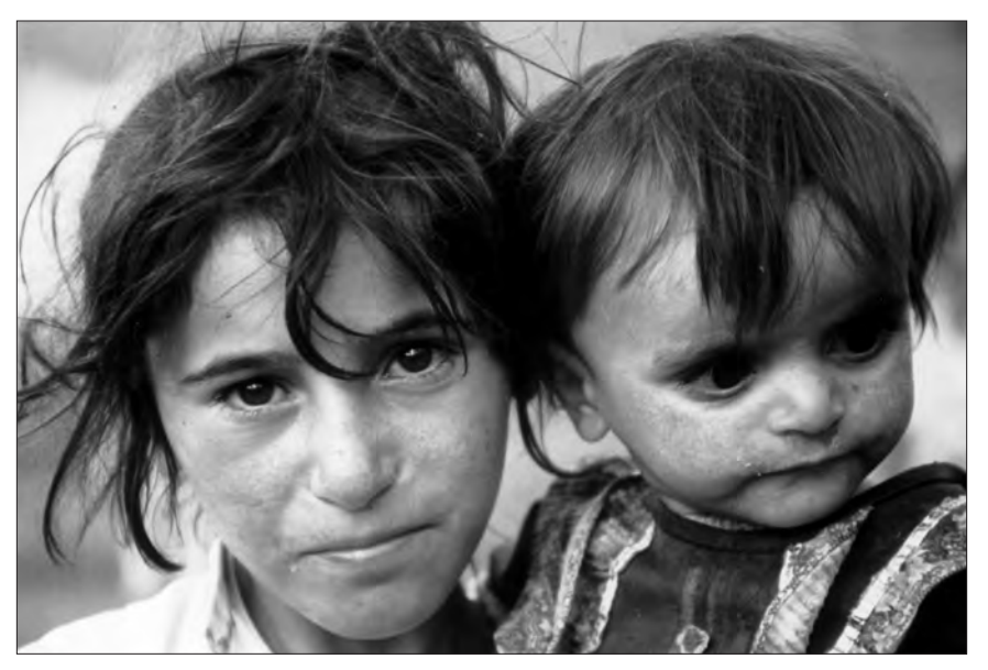
Operation Provide Comfort delivered relief supplies to Kurdish refugees.

The victims of recent wars and atrocities in Somalia, Bosnia-Herzegovina, and northern Iraq have captured the world's attention. The United States has responded to their cries for help by carrying out humanitarian relief operations to these and other areas devastated by natural or manmade disasters. The compassionate codenames chosen by U.S. policymakers for these operations—Provide Comfort, Provide Hope, Provide Promise, Provide Relief, and Restore Hope—signify the nation's determination to alleviate the suffering of those less fortunate than itself. On the heels of its spectacular and decisive role in the Gulf War, the United States Air Force has demonstrated its immense capability to airlift tons of supplies and personnel in a wide variety of highly significant relief efforts.