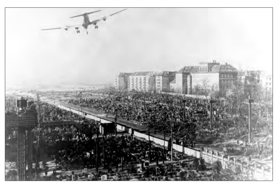
The Berlin Airlift helped keep the city in Allied hands.