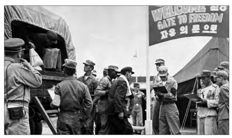
Repatriated South Korean soldiers arrive at Freedom Village in August 1953.

The armistice that ended hostilities included provisions for exchanging prisoners of war. In the course of "Little Switch," between April 20 and May 3, 1953, the UN released 6,670 prisoners of war in return for 684 held by the North Koreans. During "Big Switch," which began late that July, the allies exchanged 75,823 POWs for 12,773. A host of fourengined C–124s, C–54s, and C–97s, as well as two-engined C–46s and C–47s, brought these POWs home.<sup>14</sup>