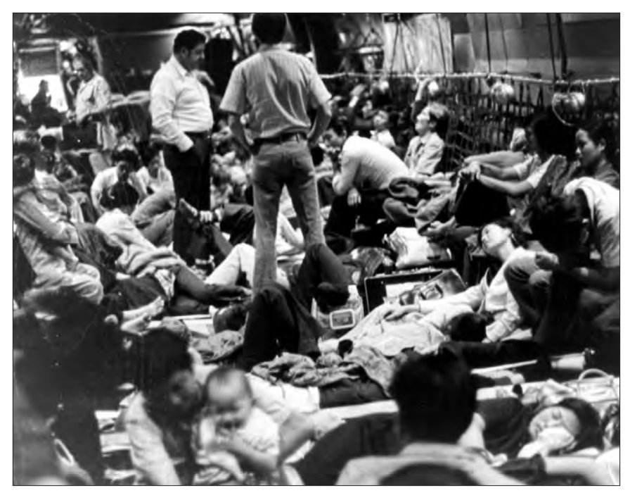
Refugees from South Vietnam being evacuated from Saigon to Guam aboard an Air Force C-141.

Babylift, New Life, Frequent Wind, and New Arrivals. Most of the Vietnamese evacuees eventually settled in the United States. At least forty aircraft participated in the emergency missions at the end of the war. Air Force planes also delivered more than 8,000 tons of supplies to temporary refugee camps in the Philippines and on Guam and Wake islands.<sup>39</sup>