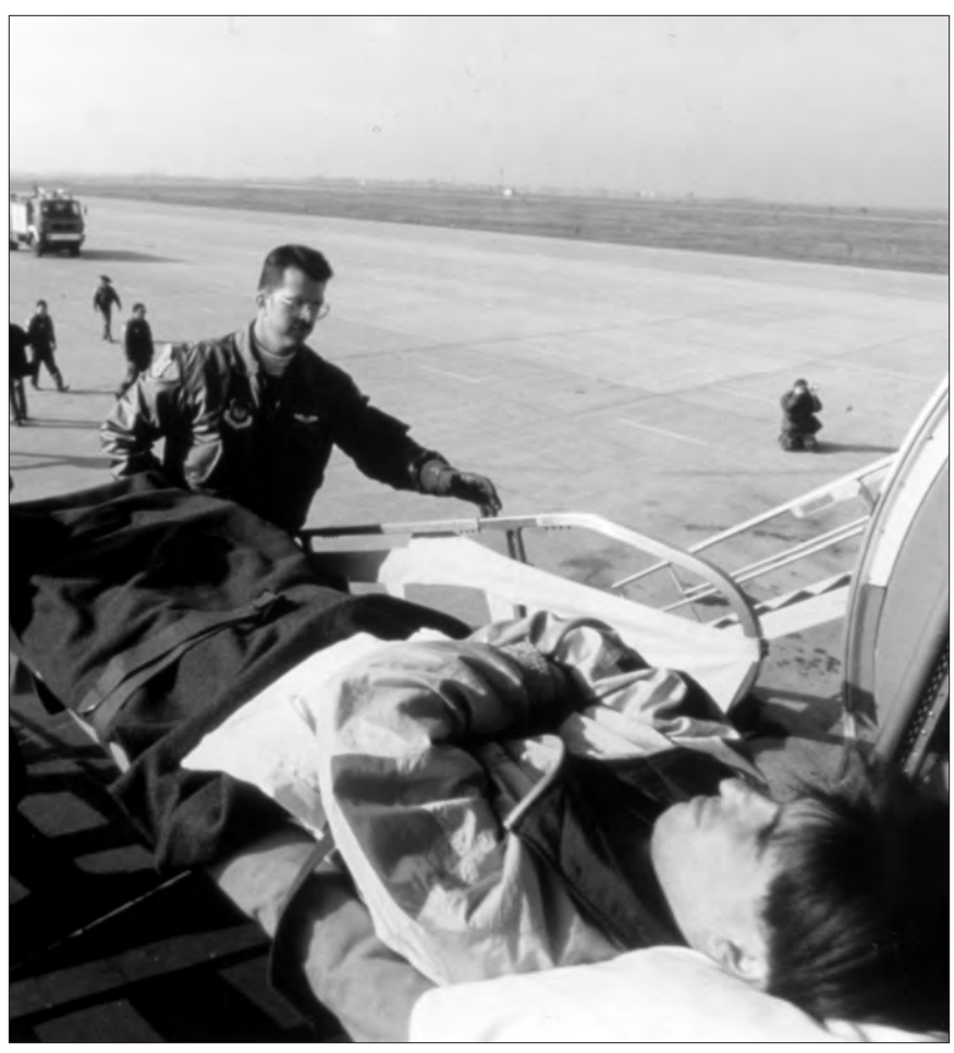
A casualty of the conflict in Bosnia is airlifted to the U.S. for treatment.