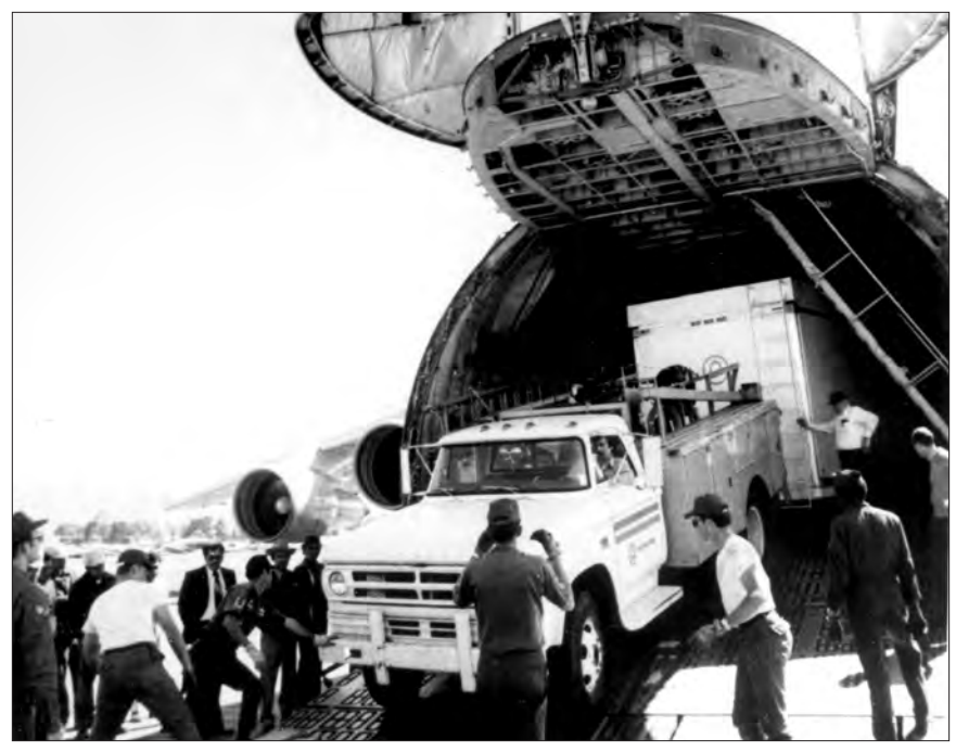
Communications equipment rolls off a USAF C-5 Galaxy in Guatemala.

rescue helicopters and a SAC U-2 provided reconnaissance to aid in rescue efforts.