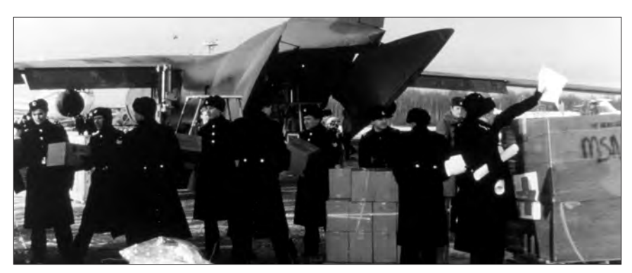
Soldiers from the former Soviet republics unload medicine and supplies from an Air National Guard C-141.

plies to the former Soviet republics, with nineteen C–5 and forty-six C–141 missions flown within seventeen days. A second phase, of 182 missions, followed from late February 1992 to September 1993.<sup>52</sup>