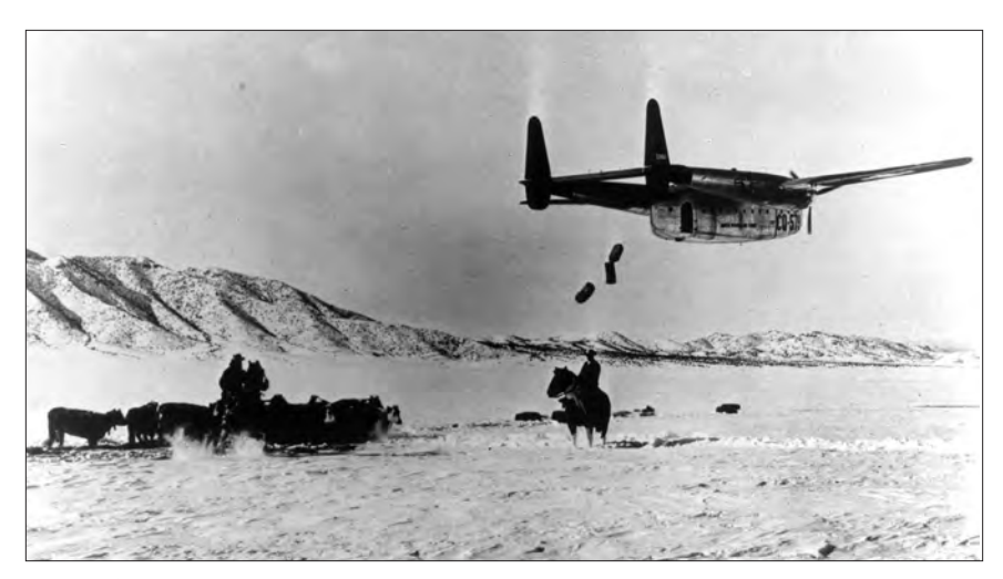
Operation Hayride supplied western states snowed under in early 1949.

largest domestic airlift, in early 1949, after blizzards hit eight western states. Cargo aircraft made more than 200 flights and transported more than 4,700 tons of supplies and equipment to areas hit by the storms.<sup>17</sup>