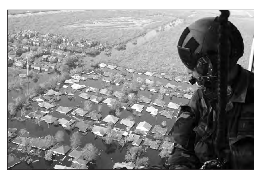
An Air Force Reserve team from the 304th Rescue Squadron searches for survivors of Hurricane Katrina.

Aug After a Russian mini-submarine became entangled in a fishnet off the Kamchatka Peninsula of Russia's Pacific Coast, a USAF C–5 transported a 32-man US Navy rescue team and equipment to Yelizovo Airport. Three other Air Mobility Command and Air National Guard transports carried more emergency personnel and equipment a day later. For example, a 172d Airlift Wing C–17 flew non-stop from New Orleans to Russia with 95,000 pounds of equipment and personnel. The four cargo airplanes, one C–5 and three C–17s, were refueled by four tankers, including a KC–10 and three KC–135s. Seven Russian sailors were eventually rescued by a British submarine. (5-8 Aug)