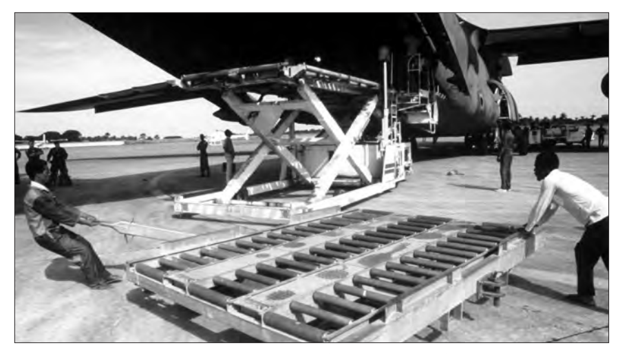
Rollers are dragged to an Air Force C–5 in Operation Africa-2.

Two of the largest Air Force humanitarian airlift operations to Africa were Authentic Assistance in 1973 and King Grain in 1974. In each instance, transporters delivered more than 9,000 tons of food to Mali, Chad, and Mauritania after a severe drought and famine. Fleets of fourengine C–130s distributed rice, wheat, flour, and powdered milk to villages in the Sahel region. The African climate prevented the planes from storing liquid oxygen for high-altitude flights, and a combination of heat, dust, poor fuel, and rocky runways multiplied aircraft maintenance problems. Yet the cargo carriers were able to deliver more than 18,000 tons of food to famine victims in less than two years. <sup>42</sup> In an October 1989 operation called Africa-2, an Air Force C–5 brought 250 tons of food, clothing, washing machines, and refrigerators to Chad and neighboring countries. <sup>43</sup>