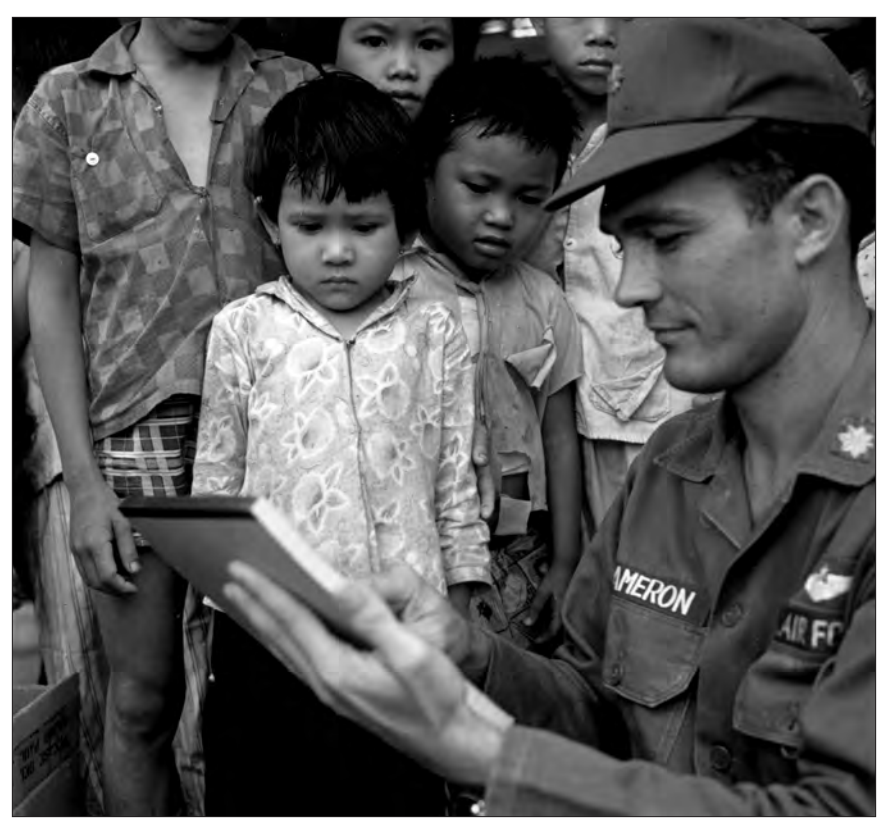
Schoolchildren of South Vietnam receive school supplies donated by citizens of Huber Heights, Ohio.

The Air Force directed several of its Vietnam-era airlift operations to Pakistan. In November and December 1970, at least seventeen C–141s and C–130s delivered over 140 tons of equipment and supplies to East Pakistan to relieve cyclone victims. The following summer the airlifters were active again in the same region. Hundreds of thousands of refugees fled to India from a civil war in East Pakistan, and thirteen C–130s and C–141s brought over 2,000 tons of food, medicine, and other supplies to them. These aircraft also evacuated more than 23,000 refugees from overcrowded camps. In 1973 Pakistan became the focus of the largest airlift, in tonnage, ever staged in west Asia. Two C–5s and twelve C–141s transported a record 2,400 tons of relief supplies and equipment to help flood victims.