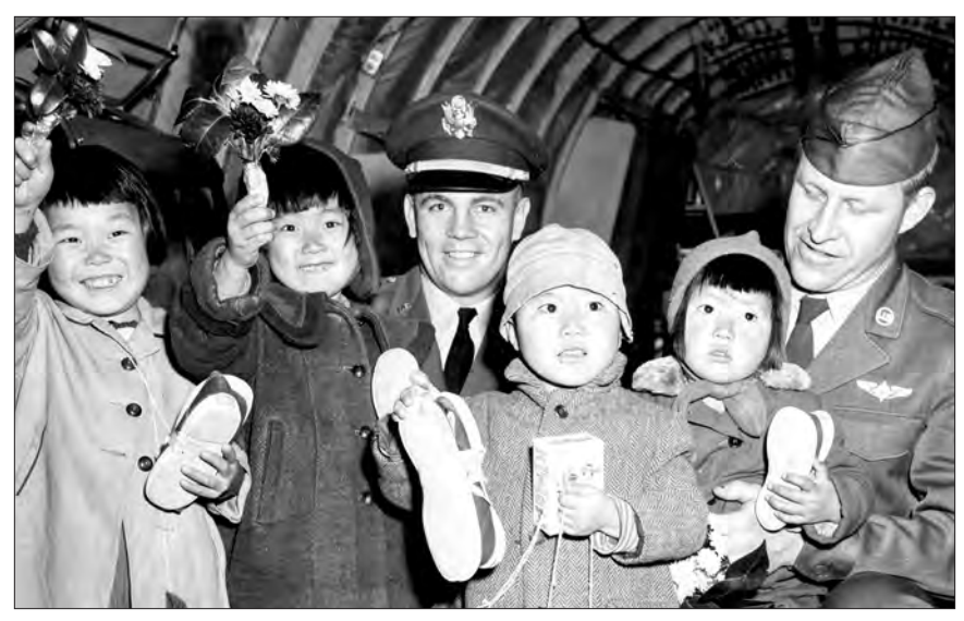
Korean children smile approval at their new attire.

Jan The USAF airlifted 4,000 pounds of clothing to help destitute Korean orphans.