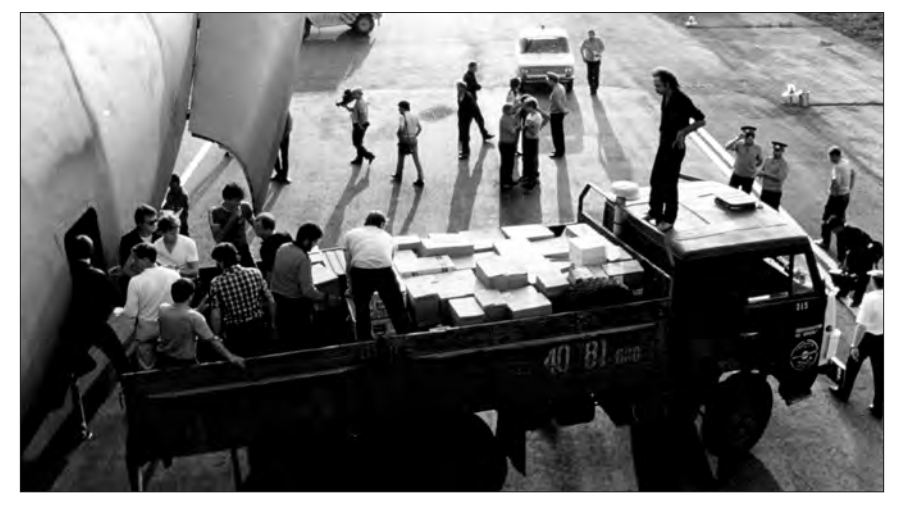
Medical equipment and supplies for the burn team are unloaded at Ufa.

Jun A C-141 transported a burn team and supplies to Ufa, Bashkiria, in the USSR to treat one hundred burned children.