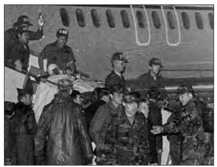
Wounded Marines are unloaded at Rhein-Main Air Base following the October 23 bombing of the barracks in Beirut, Lebanon.