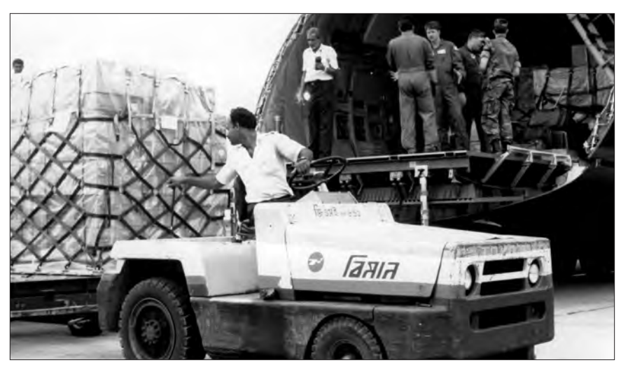
Disaster relief supplies are unloaded from a C-5 in Bangladesh.