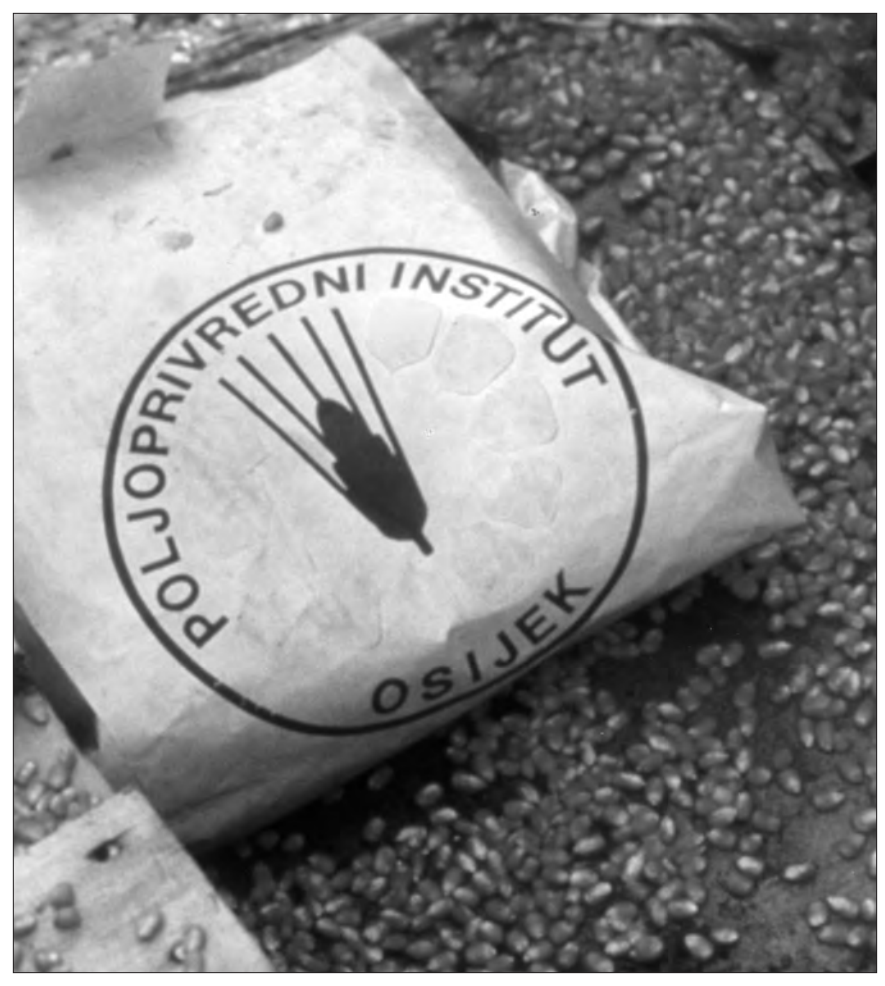
Croatian corn seeds were airdropped over Bosnia during Provide Promise.

Aug AMC aircraft began flying Operation Provide Relief missions to Somalia and Kenya to aid Somalis threatened by starvation due to anarchy in their country and a prolonged drought.