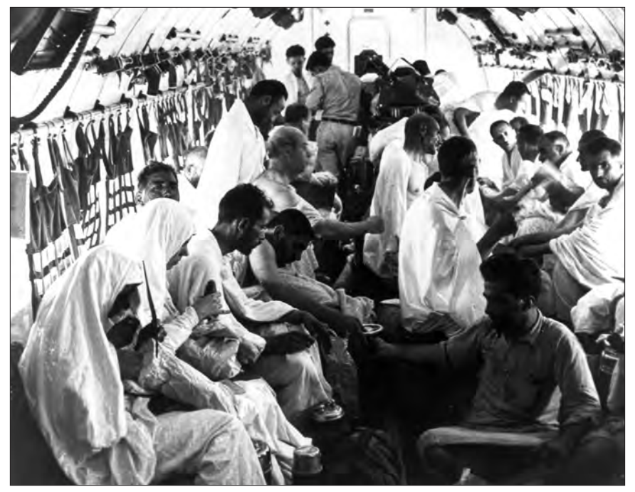
Islamic pilgrims traveling to Mecca on an Air Force C-54 in 1952.

During the Korean War, the U.S. carried out a dramatic humanitarian airlift in the Middle East that was necessitated by a breakdown of transportation arrangements, rather than by war or natural catastrophe. In 1952 about 3,700 Islamic pilgrims en route to Mecca became stranded in Beirut, Lebanon. Thirteen Air Force C–54s flew them to the holy city in time for their religious observances and won America considerable goodwill among Arabs.<sup>15</sup>