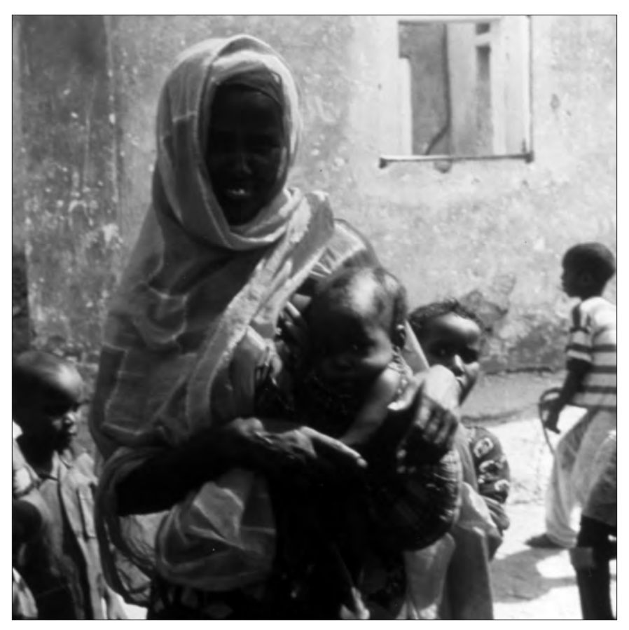
Part of the daily audience watching U.S. Marines at work in Somalia.

Sep Following Typhoon Iniki, which devastated Kauai in the Hawaiian archipelago, Air Mobility Command, Pacific Air Forces, Air Force Reserve, and Air National Guard aircraft and crews airlifted 6,888 tons of relief equipment and supplies to Hawaii. The operation also airlifted more than 12,000 passengers, including evacuees as well as military and civilian workers. (12 Sep-18 Oct)