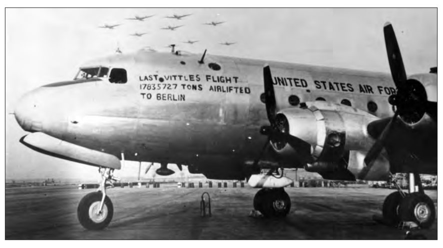
This C-54 commemorated the achievements of the Berlin Airlift.

The significance of the Berlin Airlift in international politics can hardly be exaggerated. Operation Vittles preserved West Berlin, a thorn in the side of East Germany, and contributed to German reunification under a democratic government in 1990. This historic effort proved that an airlift alone could sustain a large population which was completely surrounded by hostile forces. Operation Vittles also demonstrated America's commitment to defend the "free world" from communist expansion. Finally, the Air Force sustained the Berlin Airlift at the same time that negotiations were underway to create the North Atlantic Treaty Organization, and the successful operation provided a compelling example of the ability of the Western allies to work together.