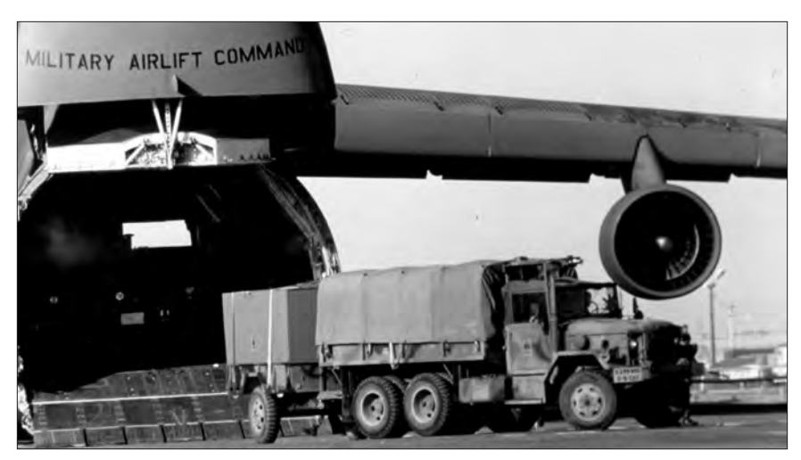
Military Airlift Command's C–5s helped deliver relief supplies to Kurdish refugees in northern Iraq in Operation Provide Comfort in mid-1991.

Army Air Service planes from Kelly Field, Texas, dropped food supplies to marooned flood victims along the Rio Grande. On a few occasions during the 1920s, American aviators bombed their own country—for good cause. They delivered ordnance against ice jams in the Delaware, Platte, and Susquehanna rivers to prevent flooding, save bridges, and restore navigation. In March 1929 at least twenty-one airplanes from Maxwell Field, Alabama, delivered twenty-seven tons of food and other supplies to flood victims in the southern part of the state.