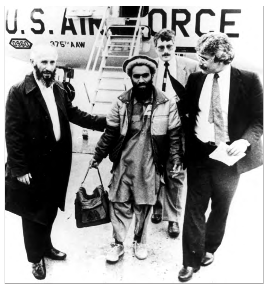
An Afghan refugee arrives by C–9 in the U.S. for medical treatment.

Mar The USAF began to deliver $10 million in relief for Afghan refugees in Pakistan, contained in an amendment to the fiscal year 1986 budget.