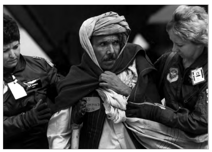
An injured Afghan refugee receives assistance upon his arrival from Pakistan.

the end of 1988, and between that December and a year later, five C–5s, fourteen C–141s, and one C–9 airlifted 547 tons of tents, blankets, medicine, food, clothing, and trucks to the victims of the disaster.<sup>47</sup>