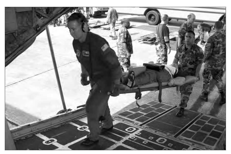
Evacuated patients from Gulfport, Miss. are loaded onto an Air Force Reserve Command C–130 toward a final destination at Andrews AFB.

regional bases chosen to shelter refugees. They also moved emergency management and medical personnel to the affected areas to care for victims in the disaster zone. Among the airlifted passengers were troops of the 82d Airborne Division from North Carolina who deployed to New Orleans to enforce the law. USAF helicopters flew 648 sorties, 599 of these on search and rescue missions that rescued 4322 people. Air Force fixed-wing aircraft flew 4,095 sorties, 3,398 of these on air mobility missions. USAF aircraft evacuated 26,943 displaced persons from New Orleans and surrounding areas to airports and bases outside the disaster area. The Air Force evacuated more than 2,600 patients to medical facilities across the country. The service also airlifted 11,450 tons of relief cargo from various parts of the country to the disaster zone. (31 Aug-10 Oct)