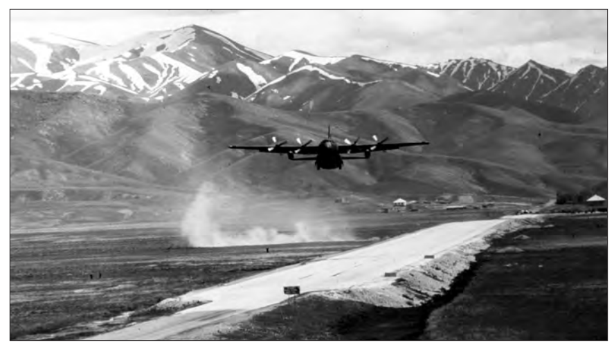
In northern Iraq, a C-130 flies over a hastily-prepared airstrip during a Provide Comfort airlift mission.

In the wake of the Gulf War, Saddam Hussein brutally crushed a rebellion of the Kurds within his own country. During Provide Comfort, flown between April and July 1991, the USAF airlifted nearly 40,000 tons of relief supplies to Kurdish refugees in northern Iraq. The operation's 1,100 missions also moved more than 14,000 of these displaced people.<sup>50</sup>