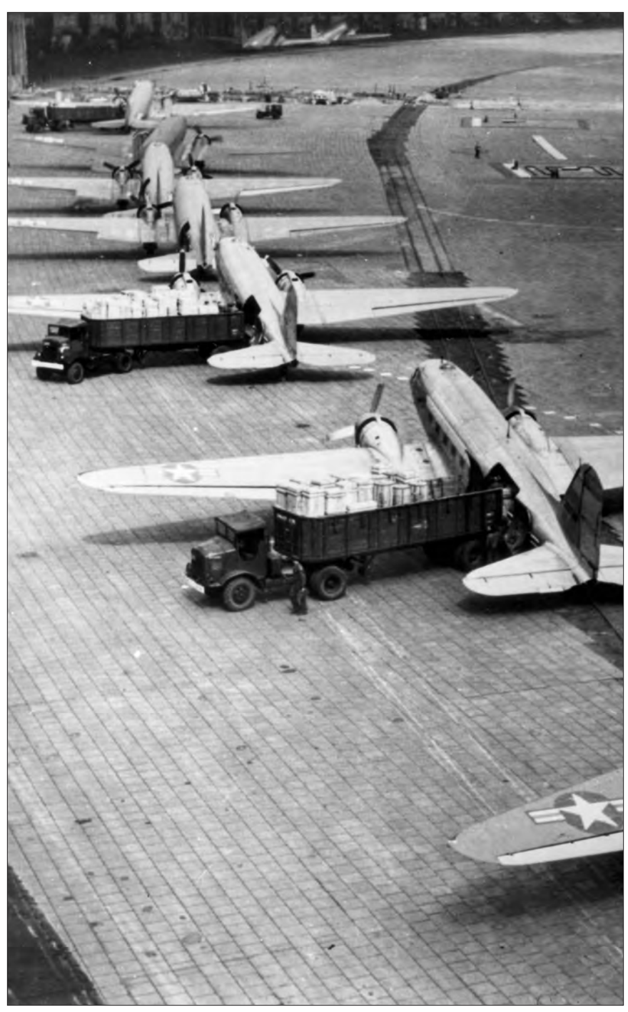
C-47s unloading on the ramp at Templehof Airport.