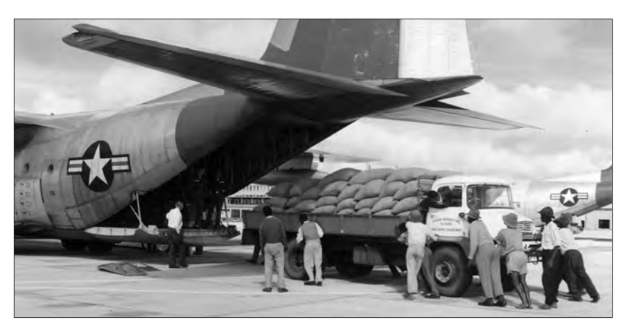
Workers in Southern Rhodesia load corn destined for the Congo.

Jan Sixteen C–130s flew more than two million pounds of food relief to the Congo to aid famine-stricken areas.