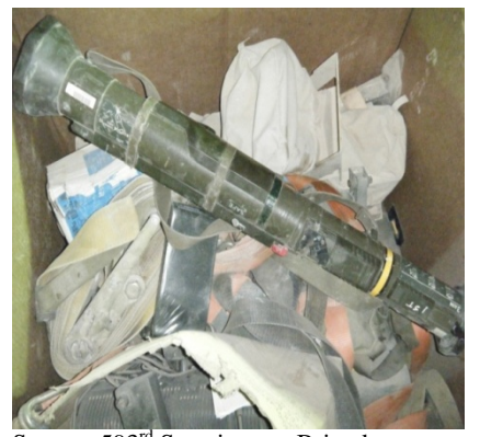
Figure 2. Weapon in Container