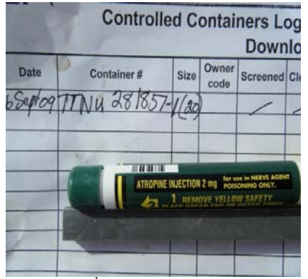
Figure 3. Potentially Dangerous Equipment