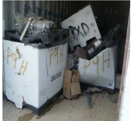
Figure 1. Damaged and Leaking Hazardous Material