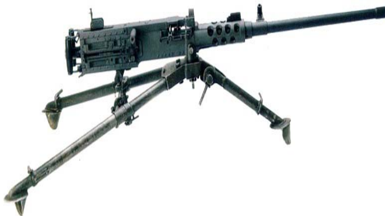
Figure 1. M2 .50 Caliber Machine Gun